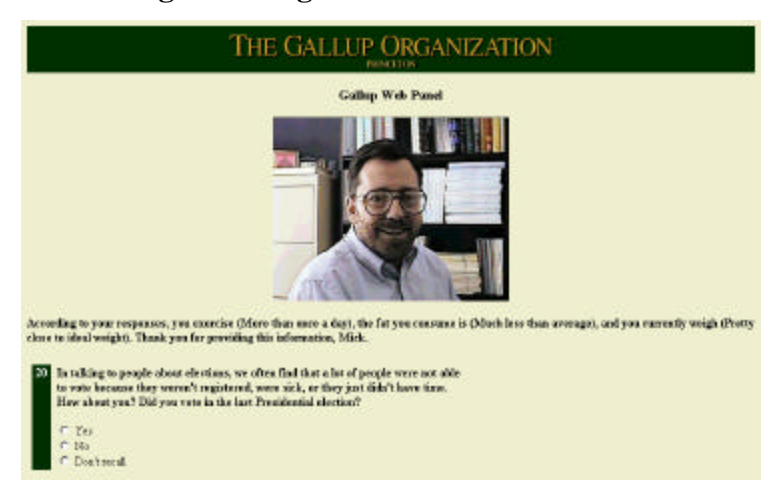
Figure 2: "Male" Interface and Personal Feedback