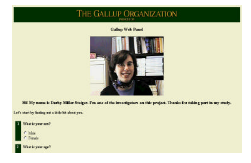
Figure 3: "Female" Interface