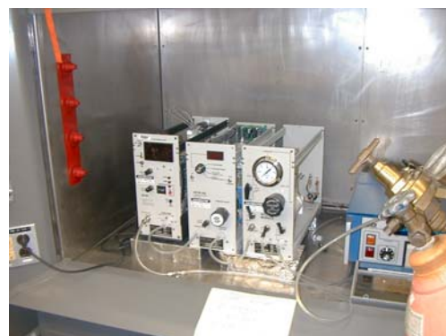
ORNL method for calibrating hydrazine monitors in the Air Force inventory