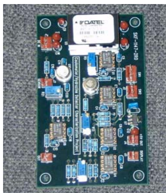
ORNL-designed coulometer circuit board.

Using this calibration method, calibration uncertainty has been reduced by 50% compared to the current method used to calibrate the hydrazine monitors in the Air Force inventory. Calibration time has also been reduced by more than 20%, and the cost per calibration has been reduced. In addition, the effect of humidity on hydrazine calibrations has been characterized.