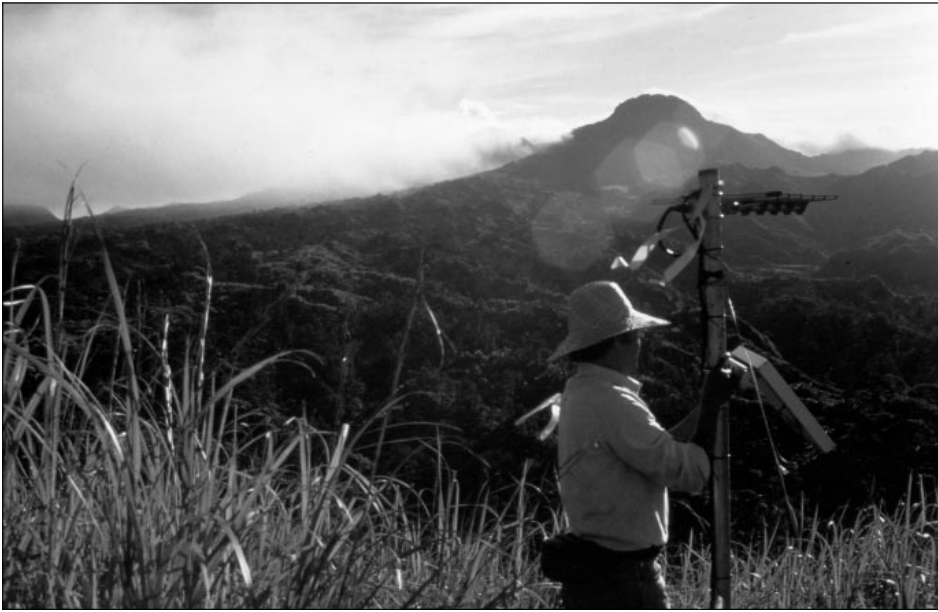
Installing a seismic station as Mount Pinatubo fumes in the background. A USGS/PHIVOLCS team installed volcano-monitoring instruments in the weeks before the climactic 1991 eruptions. This was one of several seismic stations that provided data which were critical in assessing the volcanic hazards and eruption threat of Mount Pinatubo.

A great majority of the world's potentially active volcanoes are unmonitored. Less than twenty-five percent of volcanoes that are known to have had eruptions in historical time are monitored at all, and, of these, only about two dozen are thoroughly monitored. Moreover, seventy-five percent of the largest explosive eruptions since 1800 occurred at volcanoes that had no previous historical eruptions (Simkin and Siebert, 1994). Thus, until regular volcano surveillance is much more widespread, a mobile crisis-response capability is needed to quickly assess hazards and install monitoring equipment when a volcano becomes restless. Otherwise, tragedies like the one at Nevado del Ruiz will be repeated.