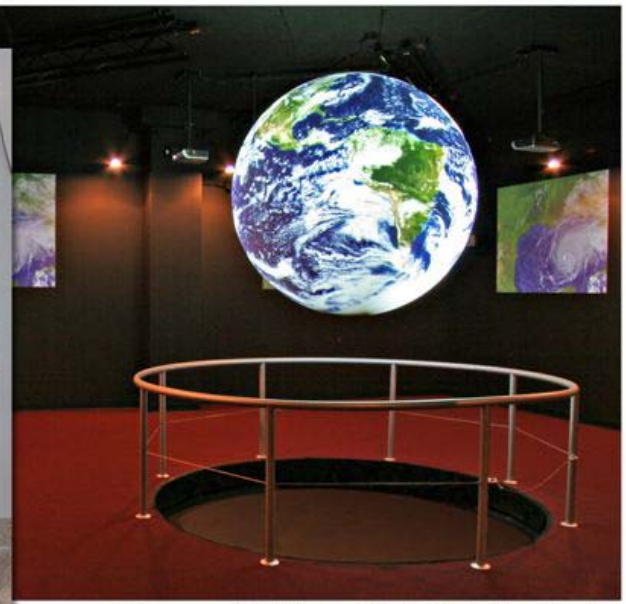
Science on a Sphere® in Planet Theater®, Boulder, Colorado