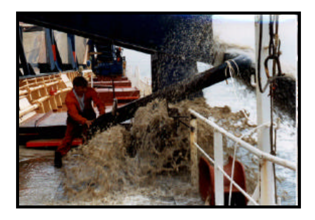
Plate 4.1.4 The practicalities of sampling the screened-off material from the reject chute

Collecting information on the reject chute has been limited due to the physical nature of the discharge. The volume and velocities encountered are considerable which requires any field equipment to be extremely rugged. A limited number of samples have, however, been obtained from an 'A' Class vessel which have then been analysed following similar procedures to the overspill samples (Plate 4.1.4). Full particle size analysis has been carried out by accredited laboratories.