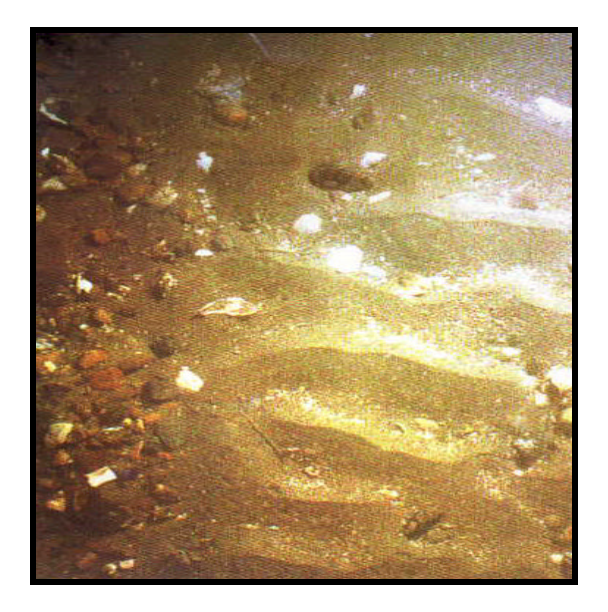
Plate 4.1.1a Underwater image taken 2 weeks after trial dredging off Norfolk showing effects of draghead on removal of coarse sediment and development of small sand ripples within the dredge furrow. Area of photograph about 0.7m2 (from Crown Estate, 1994)

Detailed measurements of high resolution sidescan sonar images of the draghead furrows were manipulated and processed using novel modelling techniques. Identification of different shape seabed furrows was largely attributable to particular types of draghead operated by different vessels. Plate 4.1.1a shows the condition of the seabed after passage of the draghead, and unaltered deposits alongside. The development of small sand ripples, orientated perpendicular to the direction of passage of the draghead is clear and has been observed from sidescan sonar imagery (Davies & Hitchcock, 1992).