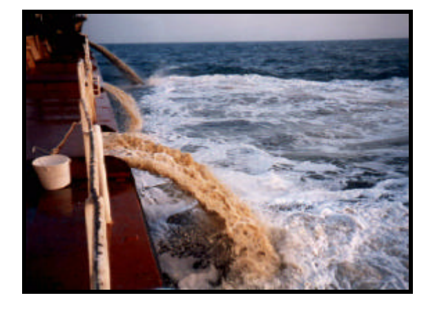
Plate 4.1.3 Sampling from the overspill

Table 4.1.3a below presents the source terms of overspill determined for approximately 360 samples obtained from two different dredge vessels working a total of five different Licence Areas. As would be expected, it is evident that the overspill solid/water ratio varies considerably according to the mode of dredging i.e. whether screening is taking place or not, for example, during loading of screened stone cargoes aboard an 'S' Class vessel solids content of the overspill may vary up to threefold. For the studies undertaken here, concentrations of overflow sediments vary between 5.5kg/l and 35.2 kg/l, with a mean of 19.95kg/l, depending on the dredger.