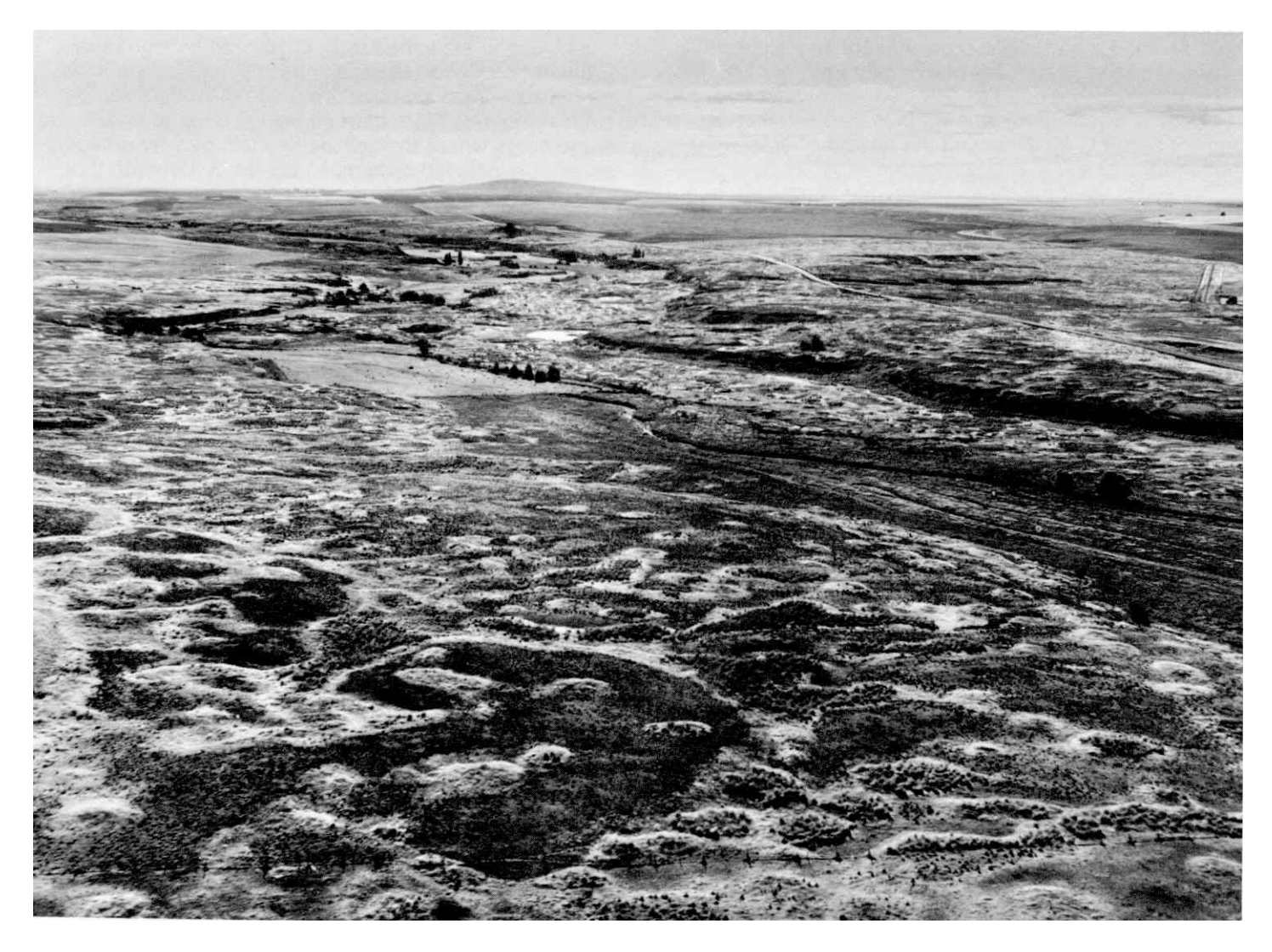
Figure 2.-Anders-Bakeoven-Rock outcrop, 0 to 15 percent slopes, is in the center and foreground of this area of the channeled scablands.

Badge very cobbly silt loam, 25 to 55 percent slopes, makes up about 40 percent of this complex; Bakeoven very cobbly loam, 0 to 25 percent slopes, makes up 25 percent; and Rock outcrop makes up 20 percent.