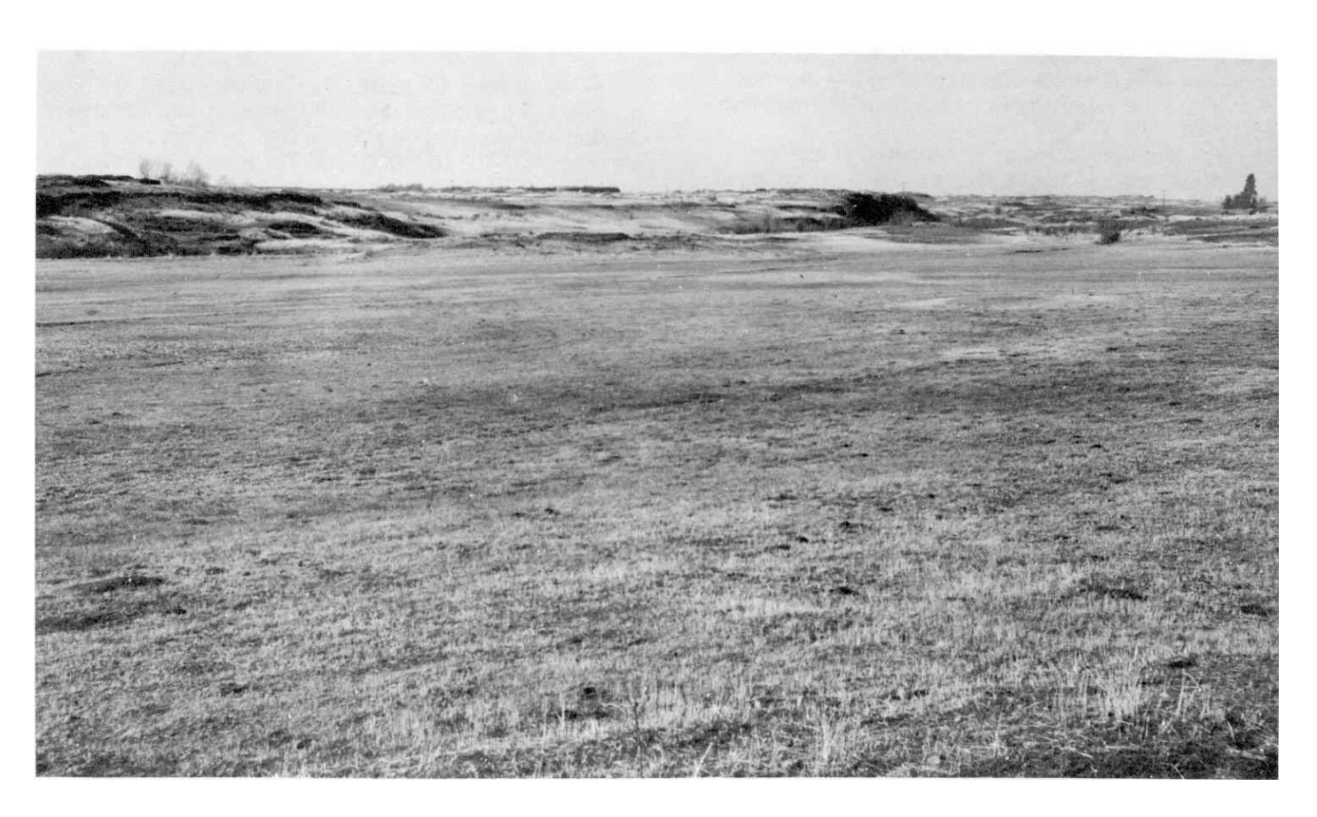
Figure 4.-In the area of Emdent silt loam in the center and foreground, basin wildrye, alkali cordgrass, and saltgrass have been cut for hay. Anders-Bakeoven-Rock outcrop complex, 0 to 15 percent slopes, is in the background.

33-Emdent silt loam, drained. This is a very deep soil on bottom lands in the channeled scablands. It formed in a mixture of volcanic ash and loess. The elevation is 1,500 to 2,400 feet. The native vegetation is