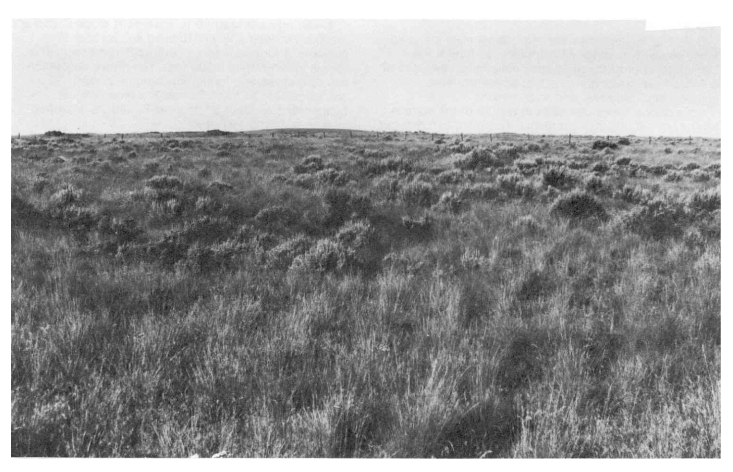
Figure 1.-This Loamy-2 range site in an area of Anders silt loam, 0 to 5 percent slopes, is in excellent condition.

Included in mapping are outcrops of basalt, Benge soils on terraces, Kuhl soils on plateaus and canyon