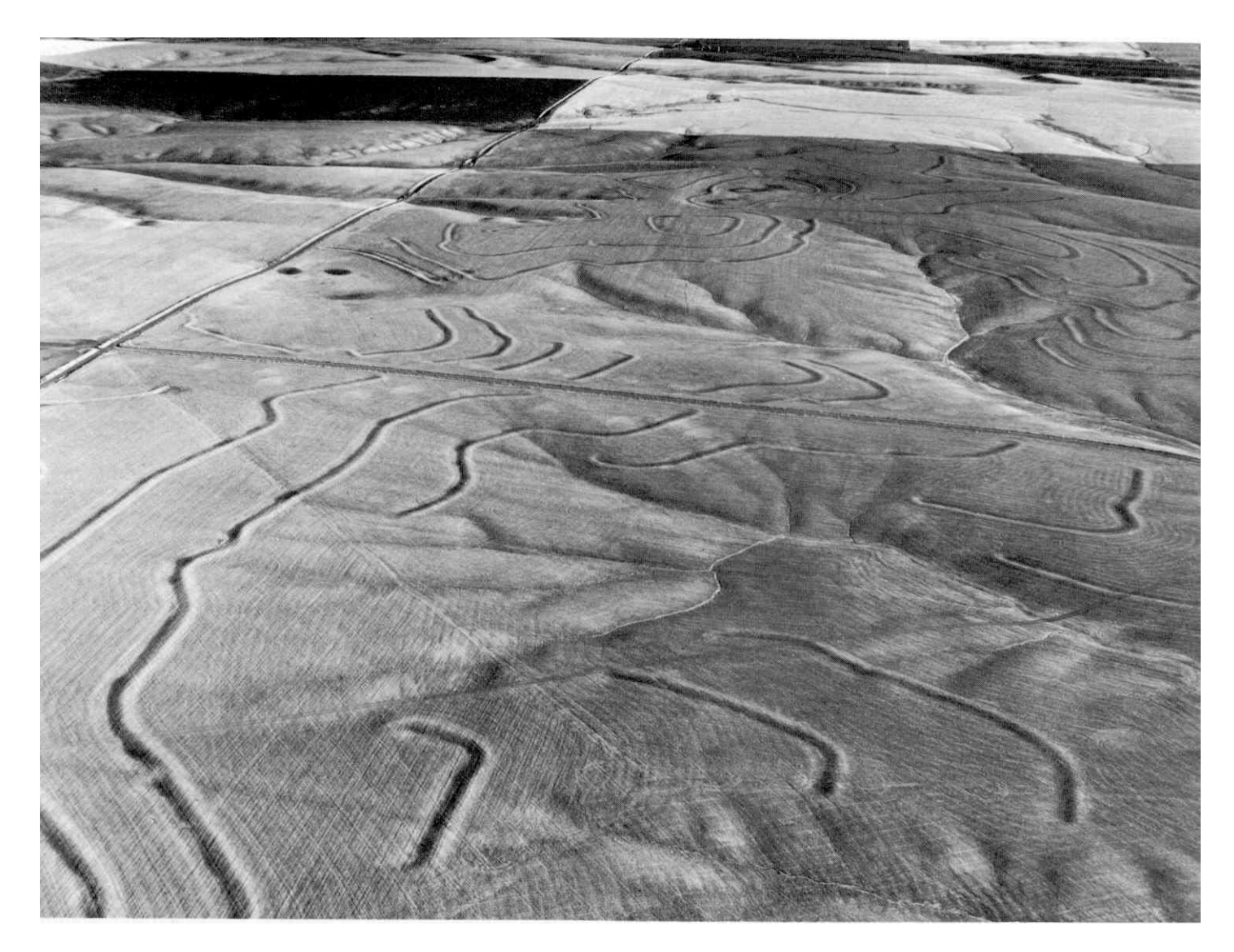
Figure 5.-In this area of Bagdad silt loam, 0 to 7 percent slopes, terraces are used to reduce the length of the slope and thus reduce rill erosion.

leaving the surface rough and cloddy, divided-slope farming, stripcropping, and cross-slope farming reduce surface runoff also. Subsoiling to break the tillage layer increases the infiltration rate of water in the profile. Where concentrated runoff occurs in the drainageways, double seeding of winter wheat in fall or use of grassed waterways helps to reduce gully erosion on Esquatzel, Mondovi, and Onyx soils. The coarse-textured Ewall soils need a vegetative cover to reduce wind erosion if the native grasses have been removed. Stripcropping at right angles to the prevailing wind or seeding permanent grass can reduce wind erosion. Reducing the speed of the tractor when farming reduces gravitational soil movement down the slope. Minimum tillage reduces the