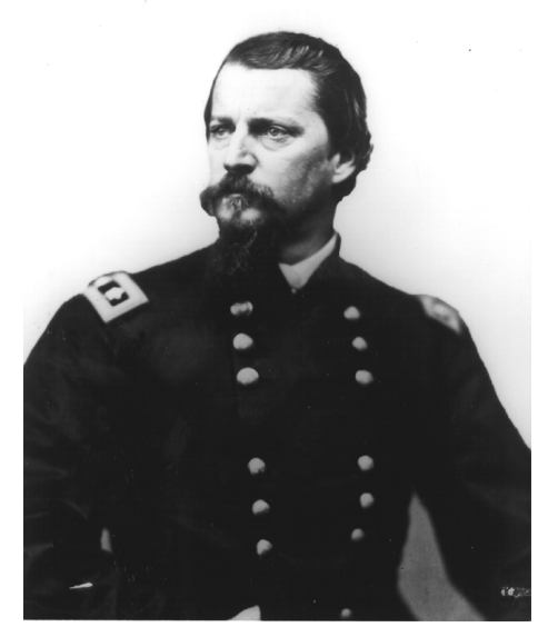
General Winfield Scott Hancock

Grading of the grounds and building construction started in 1897 but the harsh Sandy Hook winters, combined with labor and construction problems,