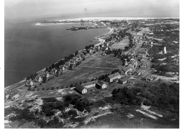
Sandy Hook circa 1930

The weapons and tactics of World War II made harbor defense forts obsolete. While many similar forts were closed, Fort