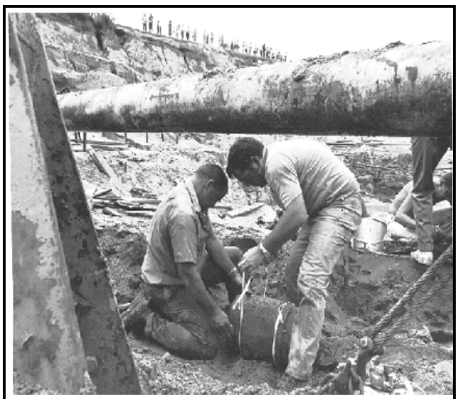
Excavating the Bertrand in the late 1960s

The primary substantive issue was the role and extent of croplands on the refuge and how far to go in phasing them out. One of many organizational questions dealt with fish and wildlife population management versus habitat management. Because of the inseparability of habitat management from wildlife population management, ultimately the team decided to combine these two into one goal area: "Wildlife Population and Habitat Management." Because fisheries management at DeSoto Lake revolves around the recreational fishery rather than conserving native aquatic biodiversity, fish population management was placed under the "Public Education and Recreation" heading.