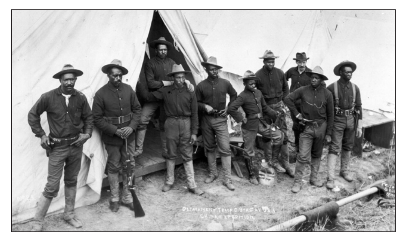
Troop C, 9th Cavalry at Camp Lawton, Seattle, 1900, preparing to embark to the Boxer Rebellion in China. The conflict in China was resolved before the company arrived, and Troop C was then diverted to the Philippine War.