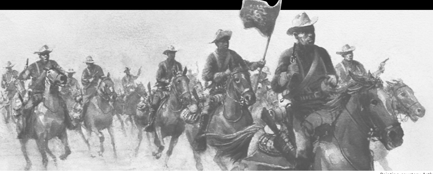
Painting courtesy Arthur Shilstone