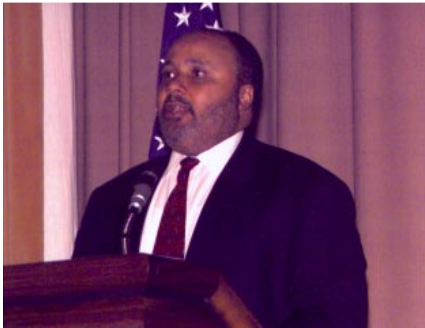
Martin Luther King III speaks at North Chicago VA Medical Center.

"We can do better. We must do better," King said. "To be a better nation, we should start paying attention to things that link us, not the things that divide us."