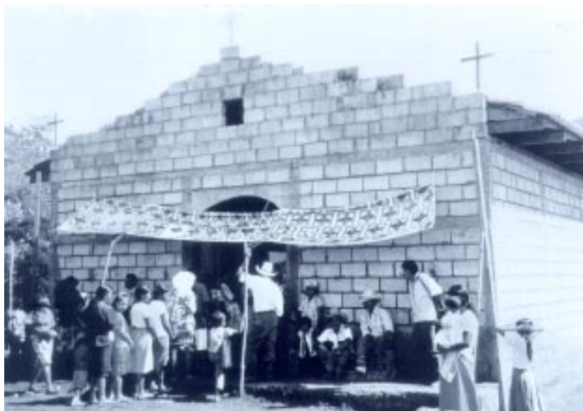
Villagers gather outside the church waiting to be seen in the makeshift clinic set up inside.