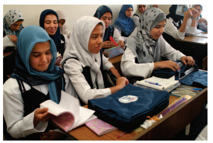
Students from a secondary girl's school in Baghdad with new school supplies.

The United States is working with 148 member economies in the World Trade Organization (WTO) to reach an agreement that will open markets to U.S. businesses, promote worldwide growth, and enhance economic development in some of the poorest countries of the world. Having played a key role in launching the current WTO Doha Development Agenda, the United States has proposed elimination of all global tariffs on consumer and industrial goods by 2015, substantial cuts in farm tariffs and trade-distorting subsidies, and broad opening of services markets.