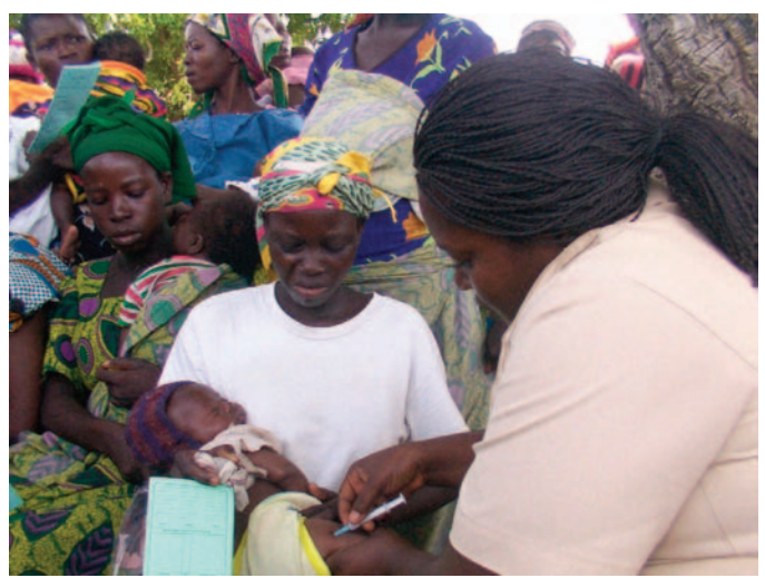
Child immunization saves lives in Ghana.

In 2004, U.S. food aid protected vulnerable populations around the world, with over $700 million donated to the food emergencies in Sudan, Ethiopia, Angola, and southern Africa, which helped feed over 14 million people. The 2006 Budget supports the Administration's continuing efforts to prevent widespread famine as well as major new efforts to make food aid more effective by requesting a portion of it as cash assistance, which allows emergency food aid to be provided more quickly and more flexibly to address the most urgent needs. The analysis of food assistance through the Program Assessment Rating Tool supports this decision to give assistance in cash.