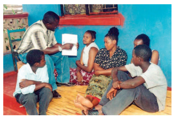
A peer educator in Zambia explains the process of voluntary counseling and testing for HIV/AIDS.

In addition to bilateral programs, the United States is helping other nations deepen their commitment to stemming the spread of HIV/AIDS through our role in international organizations like UNAIDS, WHO, and the Global Fund to Fight AIDS, Tuberculosis, and Malaria. This Administration provided the founding contribution to the Global Fund, and the United States remains by far the world's largest donor to it. The President's Emergency Plan is working with UNAIDS and other international organizations to implement the "three ones" in countries that receive assistance: one national plan, one national coordinating authority, and one