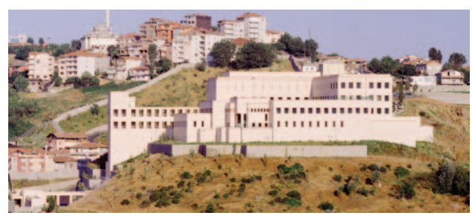
A view of the new embassy compound in Istanbul, Turkey.

In 2003 and 2004, the State Department completed construction of several new embassy compounds, including compounds in: Tunis, Tunisia; Zagreb, Croatia; Abu Dhabi, United Arab Emirates; Istanbul, Turkey; and Sofia, Bulgaria. In addition, the State Department has 22 projects under construction and has awarded contracts for 12 new projects.