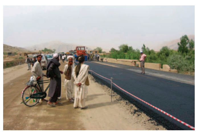
The paving of the Kabul Kandahar road in Afghanistan.

Supporting Democracy in Afghanistan. On December 7th, 2004, the first democratically elected Afghan President was inaugurated, following the first free and fair election in Afghanistan's history. The economy grew 16 percent during the last Afghan fiscal year, 2003–2004, and the new Afghan currency has remained strong. The lives of Afghans, especially those of women and children, continue to improve, and 2.4 million refugees have returned home. Today over 40 percent of primary school students are girls, up from virtually zero under the Taliban, and overall enrollment for boys and girls has increased