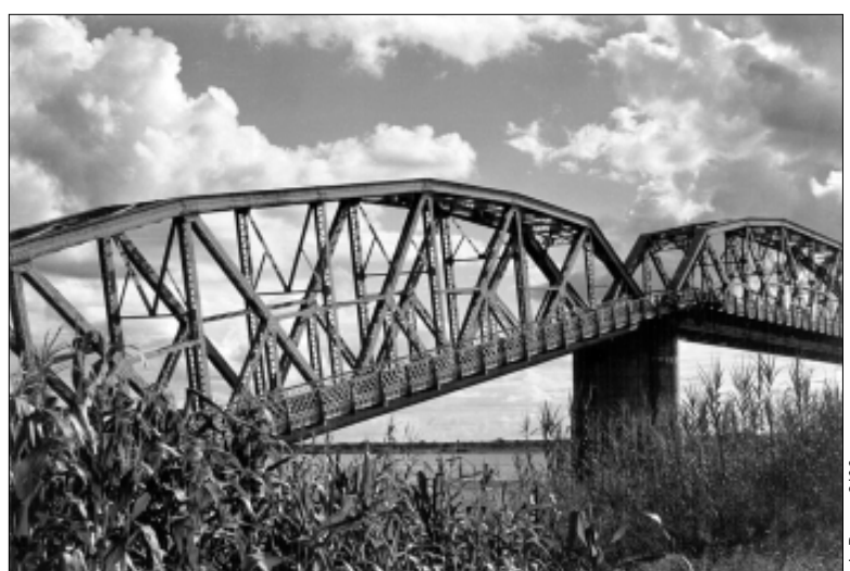
DESTRUCTION OF INFRASTRUCTURE was extensive during the war. The 2.5-mile-long Don Ana rail bridge across the Zambezi River at Mutarara was blown up in 1986 by Renamo insurgents. That cut trade with Malawi and between the northern and southern halves of Mozambique. After the war, USAID emergency assistance rebuilt the bridge for use by vehicles.

Internally displaced persons consistently reported they survived the war with food aid, by cultivating small amounts of land, and by earning money through petty commerce to buy food. Food aid thus was part of their survival strategy but not necessarily the major or most reliable component, because, the majority re-