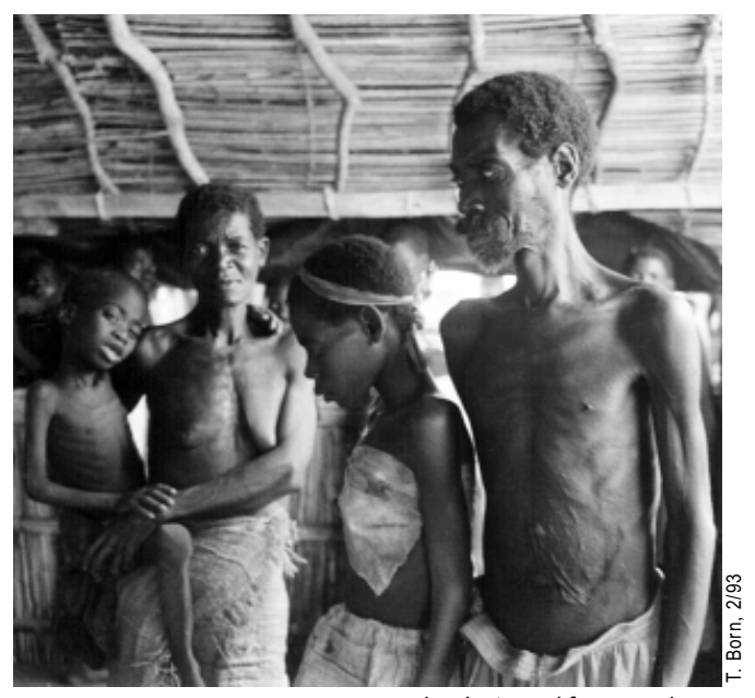
PEOPLE LIVED IN FEAR OF SOLDIERS who destroyed farms and tortured or killed civilians. This family hid in the bush for two years before coming into a USAID-supported feeding camp in Sena. The family had nothing—they are wearing grain sacks for clothing. They are severely malnourished, the son near death from starvation and the daughter blind from an infection or lack of vitamin A.

equipment. Losses remained high although accountability improved. In 1992, when disaster shipments were at their peak, the Agency finally removed U.S. food aid from DPCCN management. From then on, much of it was managed from port to recipient by American PVOs.