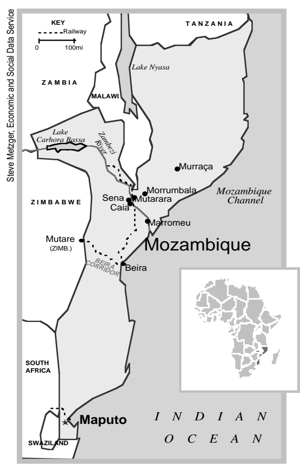
CIVIL WAR between soldiers of the Marxist-leaning Frelimo government and Renamo insurgents uprooted roughly half of Mozambique's 16 million people. More than 2 million took refuge in neighboring countries; 4 to 6 million withdrew to safer areas within the country. The 16 years of hostilities ended in 1992 when neither side had victory in sight.

dealt with the emergency and those who received emergency aid.