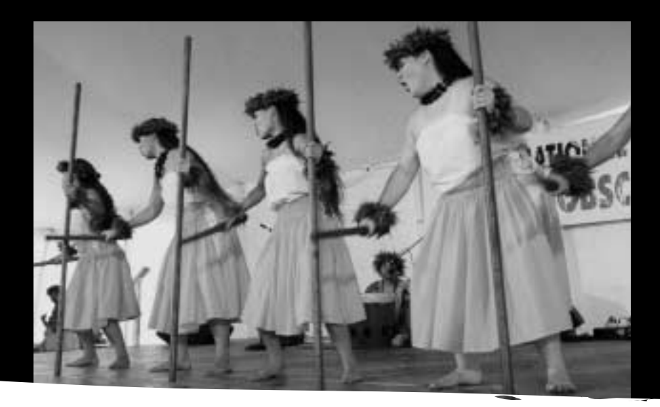
Hula Halau 'O Lilinoe brought ancient Hawaiian dance and music to the 64th National Folk Festival in Bangor, Maine.