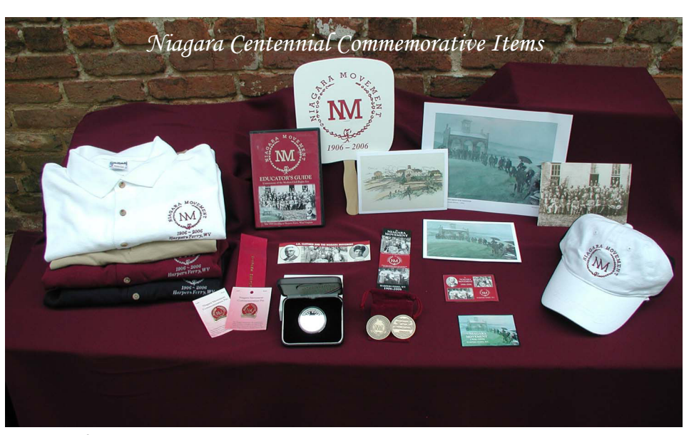
A variety of books, music, and art will be available at the Harpers Ferry Historical Association Sales Tent on the Mather Lawn.

Closing Ceremony - Presentation of Niagara Centennial Plaque followed by gathering for centennial photograph on Mather Lawn