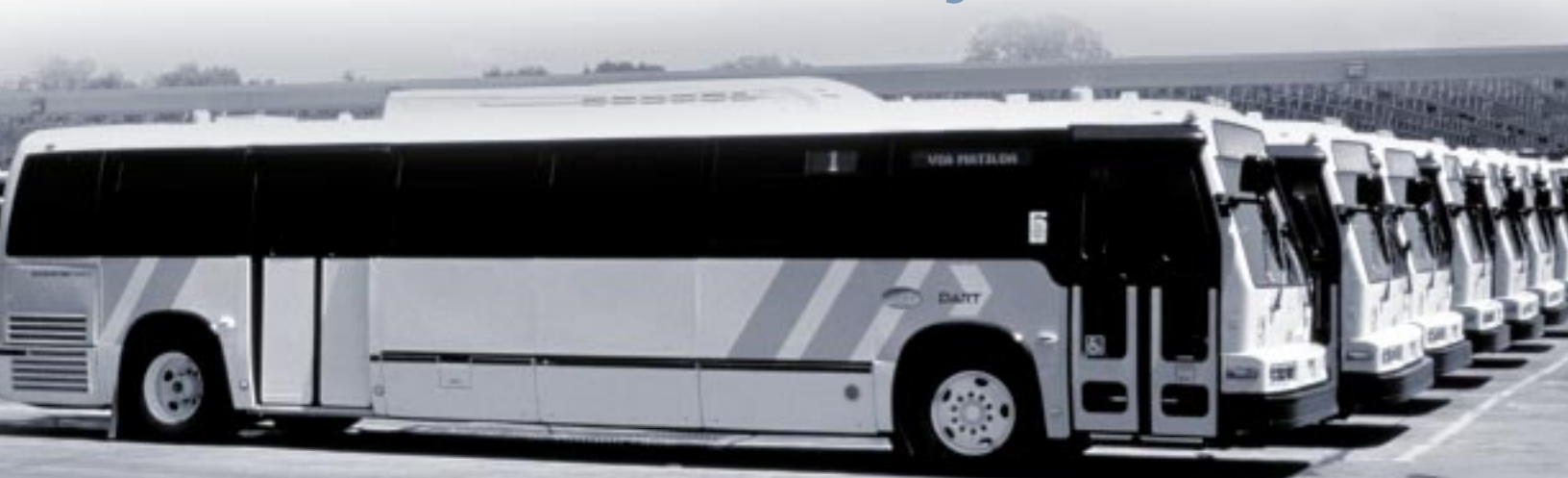
DART's 989 buses and vans include 141 natural gas transit buses.