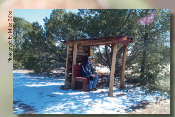
Crosby Canyon Overlook

The peak trailing year for the driveway was 1919, when 150,000 sheep and 21,677 cattle made the journey.