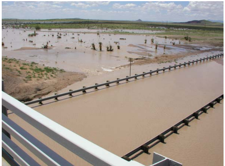
On August 28 Interstate 10 is closed between Las Cruces and Deming after torrential overnight rains flood the highway.

September 11: Severe thunderstorms pound east El Paso with nickel-size hail falling.