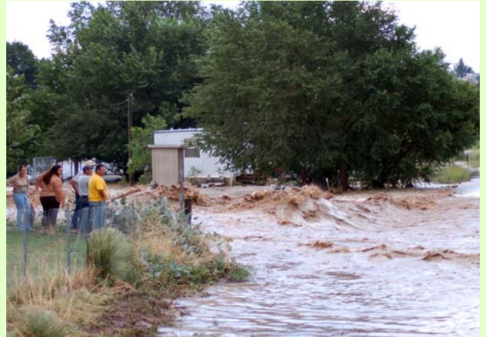
Over three inches of rain fall around Silver City on July 28 flooding the San Vincente area.

July 31: Slow moving thunderstorms with more very heavy rains cause widespread flooding across sections of El Paso and Dona Ana Counties. Rockslides and debris shut down Trans Mountain Road through the Franklin Mountains. Street flooding also closes some El Paso roads while water submerges cars in Santa Teresa.