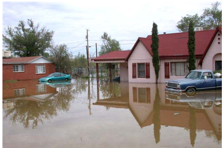
Emory Road in west El Paso.