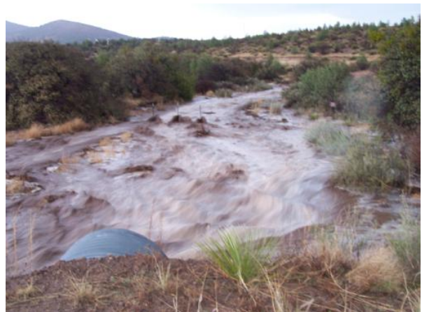
An arroyo floods near Silver City during the heavy rains of May 15.