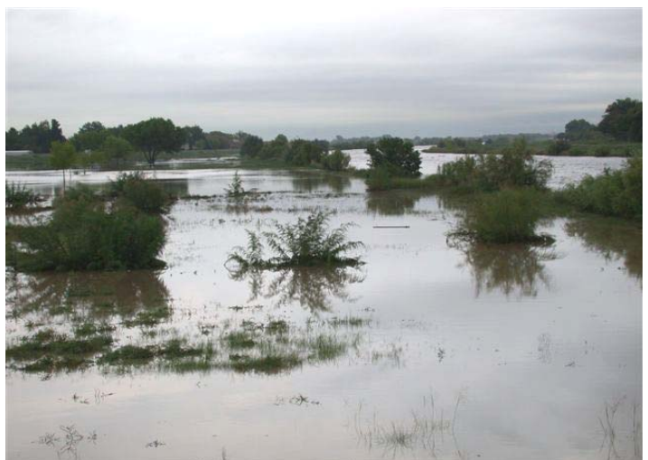
The Rio Grande overflows along Country Club Road in El Paso.