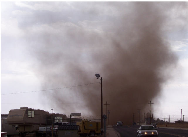
On May 13 this weak tornado moves across Alamogordo.