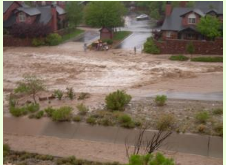
Flooding in the Silver Springs area of El Paso.

August 3: Early morning thunderstorms with heavy rains rumble through El Paso and Dona Ana counties with one to two inches of rain falling within two hours. As a result more flooding occurs around El Paso, Santa Teresa and Sunland Park. High waters pour into several homes and businesses over sections of El Paso with the flooding around a four block area of Saipan and Reynolds Streets especially severe. Numerous roads are again closed including Interstate 10. Flooding also occurs across much of west El Paso.