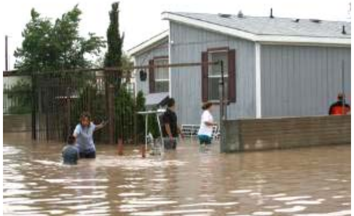
August 1 flooding destroys or damages much of Canutillo.