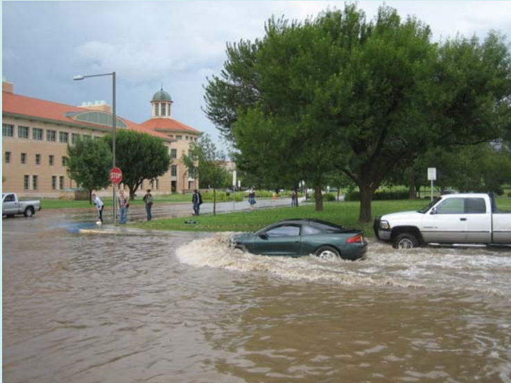
The September 13 supercell thunderstorm also drops torrential rainfalls over the Las Cruces vicinity with flooding around New Mexico State University.