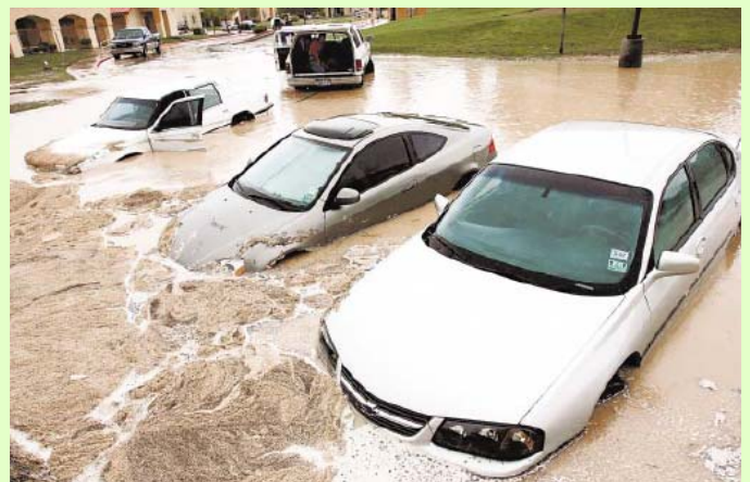
High waters submerge cars in Santa Teresa after the heavy rains of July 31.