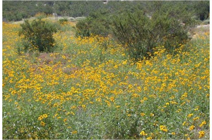
Wildflowers in bloom over Santa Teresa.

From July to September 2006 El Paso International Airport measures 15.01 inches of rain making the 2006 monsoon officially the wettest on record. In addition a few public or cooperative observers measure over thirty inches of rain around the borderland as much of the southwestern United States including western Texas, New Mexico and Arizona experience record rainfalls. The wet weather brings extremely dense vegetation growth with the once barren sands covered by flowers and an abundance of green plants.