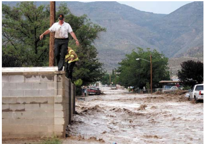
Abbott Street and Boyce Avenue in Alamogordo after the June 22 heavy rains.

June 22: Thunderstorms dump up to four inches of rain over northern Otero County causing major flash flooding across Alamogordo. Rains turn streets into raging rivers with homes and buildings flooding, property and infrastructure damaged and some vehicles being washed away. Water reaches window-level on a few streets forcing evacuations in some neighborhoods. Serious flooding also occurs at Boles Acres and Marble Canyon with total damage estimated at two million dollars.