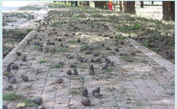
Large hail strips pine cones off of trees in Las Cruces.