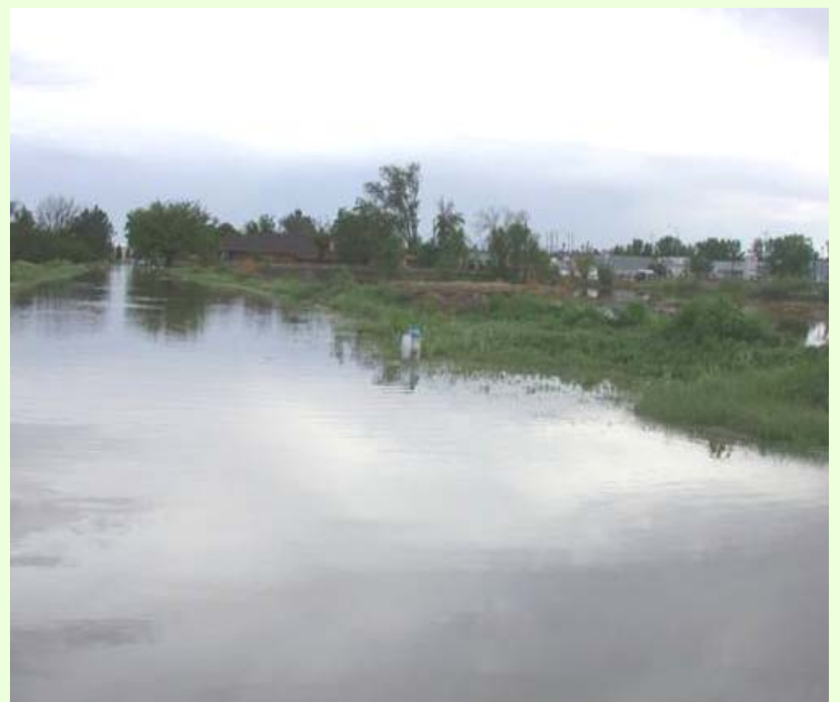
August 19 early morning downpours again flood areas of west El Paso.

August 19: Early morning thunderstorms bring one to two inches of rain around west El Paso, Santa Teresa and Sunland Park with more street flooding and road closures.