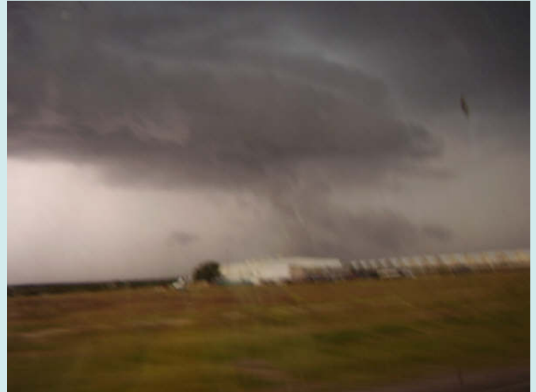
Tornado over western portions of Las Cruces.