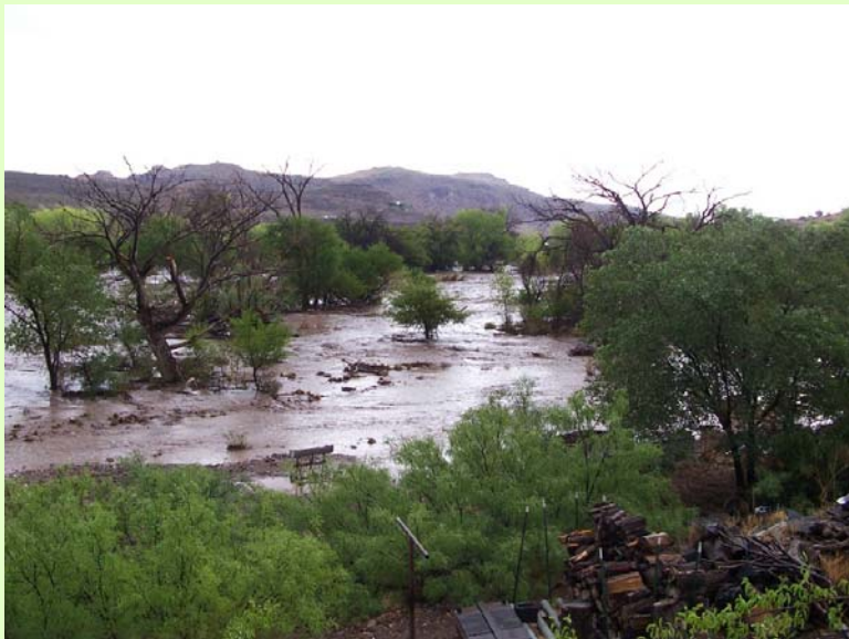
Very heavy rains on July 28 cause the Percha Creek to overflow near Hillsboro.