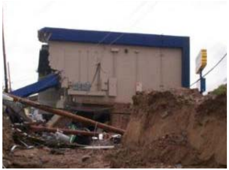
Rapidly moving floodwaters demolish a Blockbuster Video building in west El Paso.

By afternoon a state of emergency is declared across the area with soldiers and helicopters from Fort Bliss providing much needed rescue assistance.