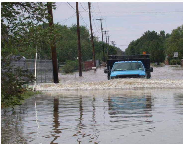
Mulberry Street in west El Paso.

August 12: Hudspeth County thunderstorms produce two inches of rain in an hour and small hail causing street flooding around Dell City.