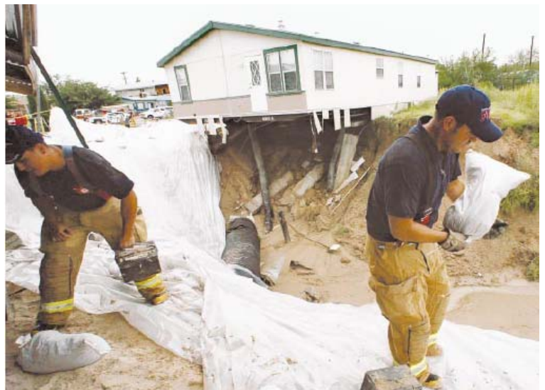
Sunland Park firefighters attempt to stop a home from falling into a sinkhole caused by the heavy rains and floods brought by Tropical Storm John in early September.