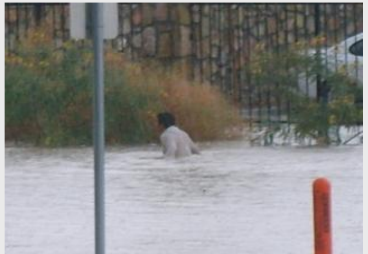
August 1 flooding at Donaphan and Frontera in west El Paso.