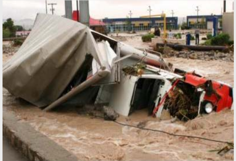
The August 1 2006 deluge severely floods and damages much of west El Paso including the Thunderbird and Mesa area where rushing waters destroy this eighteen-wheeler.