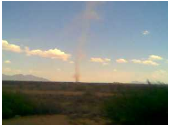
Despite the rain and clouds there are a number of hot dry days in June and early July resulting in early summer dust devil activity.