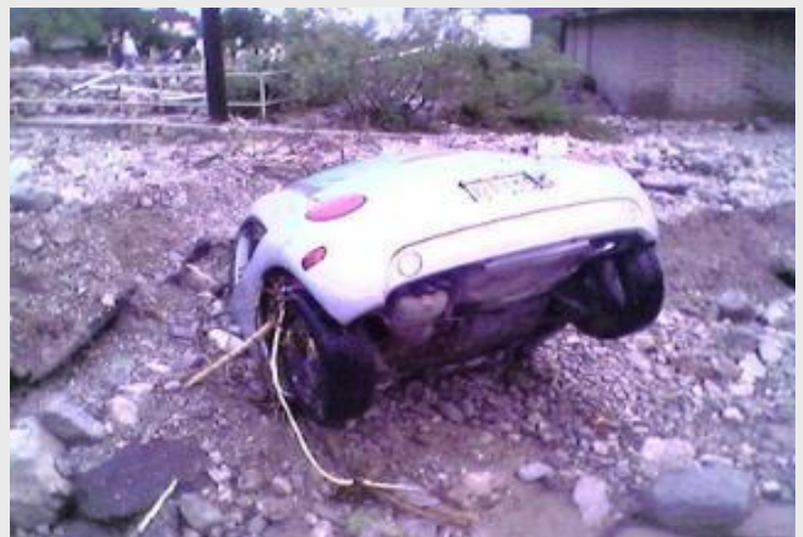
Numerous vehicles are submerged or washed away by floodwaters over west El Paso and surrounding communities.