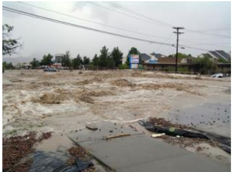
On Aug 1 2006 torrential rains produce widespread flash flooding and major damage across El Paso including the Shadow Mountain area above.

The good news is no deaths or serious injuries were reported from the floods.