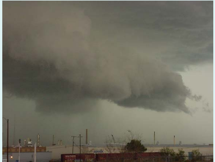
On July 6 this high precipitation supercell brings heavy rains and major flooding to Jaurez Mexico before moving into the El Paso and Santa Teresa areas. The floods kill at least six people in Jaurez.

July 15: Severe thunderstorms with heavy rains bring quarter-size hail to Fabens and widespread street flooding and small hail to portions of the El Paso Metropolitan area.