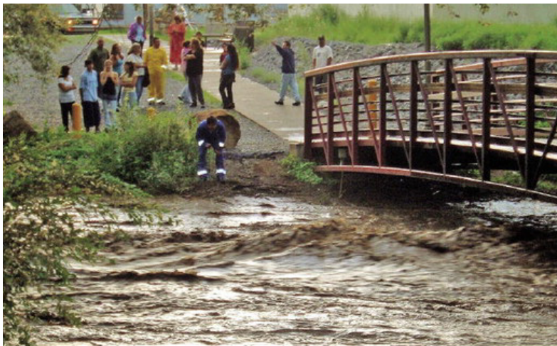
August 10 flooding at Santa Clara.