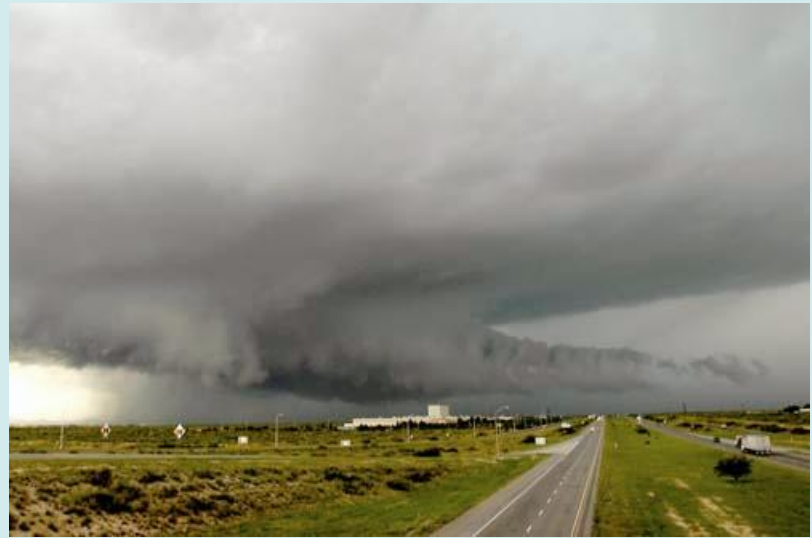
On September 13 this high precipitation supercell thunderstorm moves into the Las Cruces area producing a tornado and large hail.

The hail was especially destructive with widespread damage to roofs, skylights, motor vehicles and vegetation. Strong thunderstorm winds also damage property and buildings over western Las Cruces and flash flooding occurs around New Mexico State University and along portions of Interstate 10, which is closed by police during the storm. Total storm damage is estimated at over 10 million dollars.