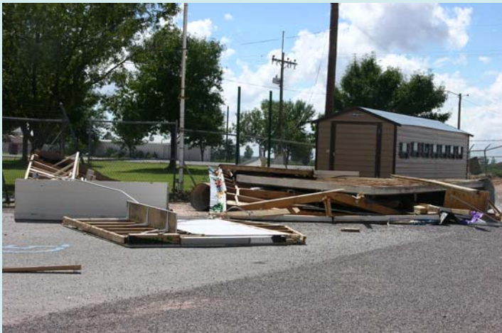
Wind damage at Las Cruces Fairground.