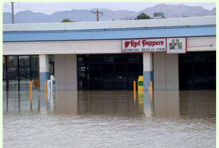
Strip mall flooding on Donaphan Street in west El Paso.

During the late afternoon thunderstorms with torrential rainfalls flood streets and close roads over areas of Las Cruces and the town of Dona Ana. Further west heavy rains flood portions of Grant County around Bayard, Hurley and Santa Clara.