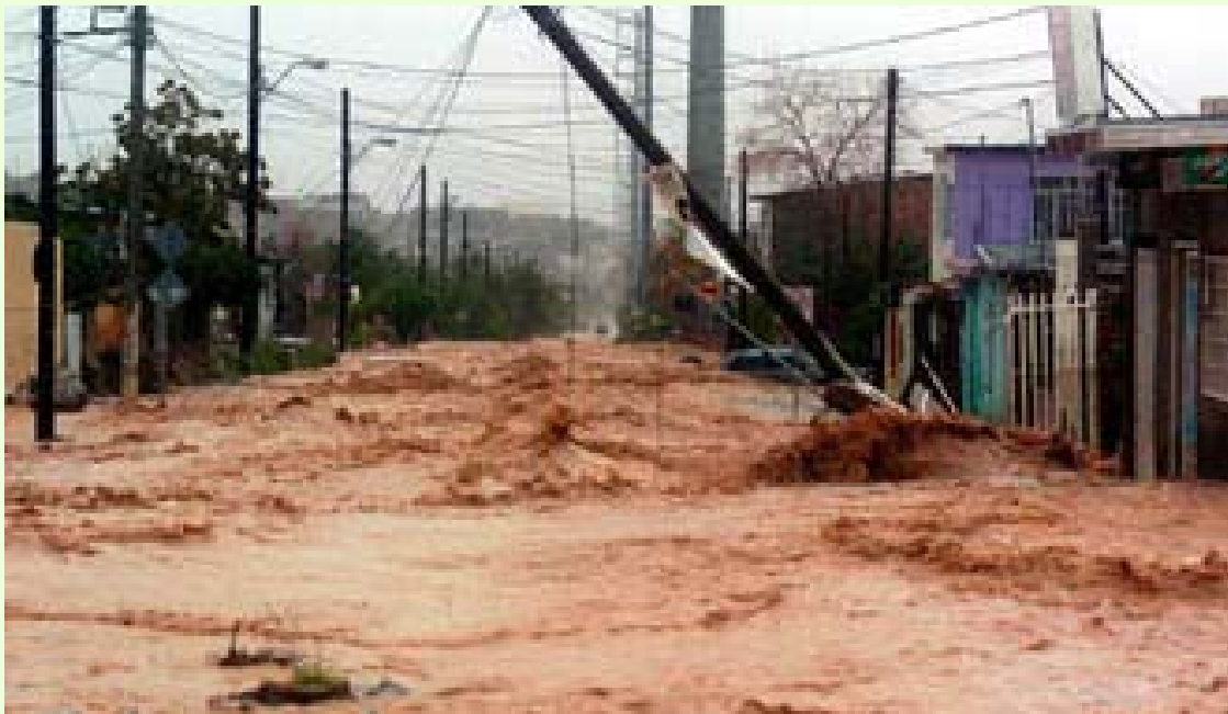
Torrential August 1 rains also flood and seriously damage much of Jaurez Mexico.