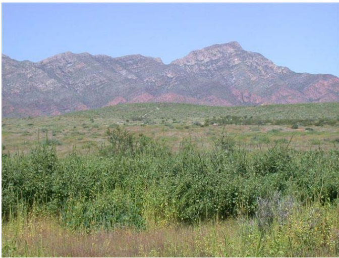
West El Paso along Franklin Mountains.