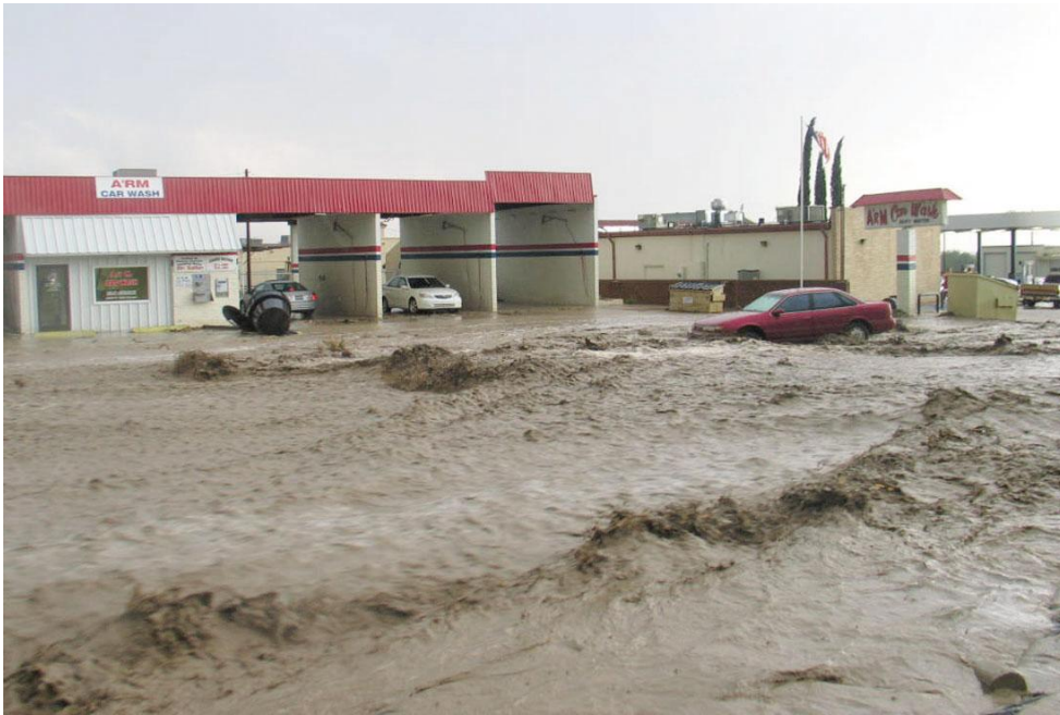
On June 22 torrential downpours severely flood portions of Alamogordo with 10 th Street becoming a raging river.