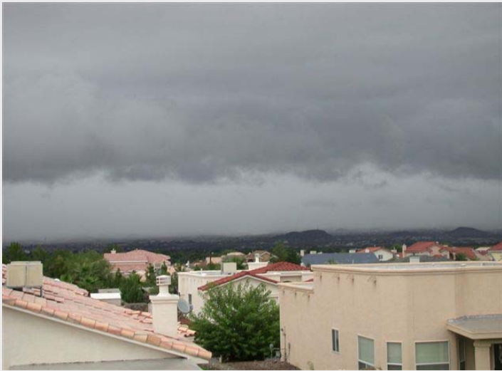
This shower and thunderstorm complex remains almost stationary over west El Paso and surrounding areas for about seven hours bringing the worst flooding in the city's history.

On August 1 a trough of low pressure moves slowly across southern New Mexico and western Texas while extremely moist and weakly unstable air flows into the region. With the wind speeds aloft weak, this weather pattern generates widespread rain showers and a few thunderstorms over western El Paso and southern Dona Ana Counties during the early morning with storms becoming almost stationary and dumping heavy rains through the morning and early afternoon. As a result probably the worst flooding on record occurs around the El Paso Metropolitan Area with three to eight inches of rain falling.