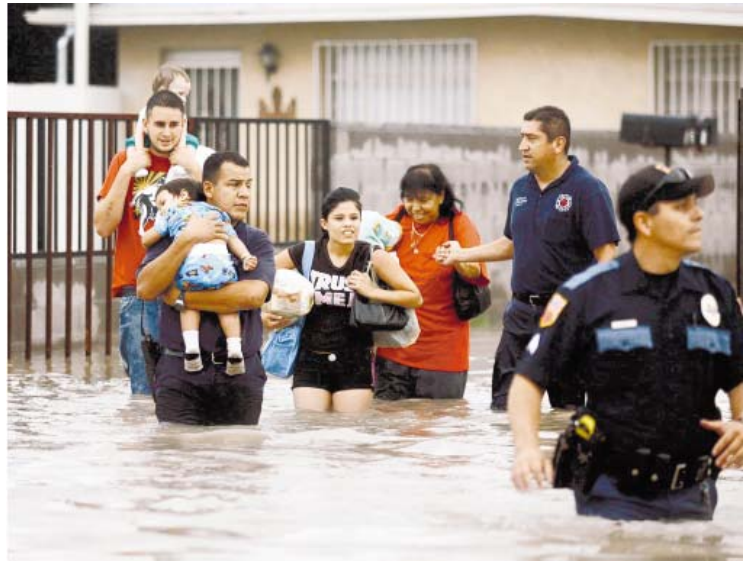
El Paso police and firefighters evacuate residents from Durazno Avenue after the heavy rains of August 4 flood their neighborhood.

August 11: Severe thunderstorms strike Hidalgo County with golf ball-sized hail falling at Antelope Wells.