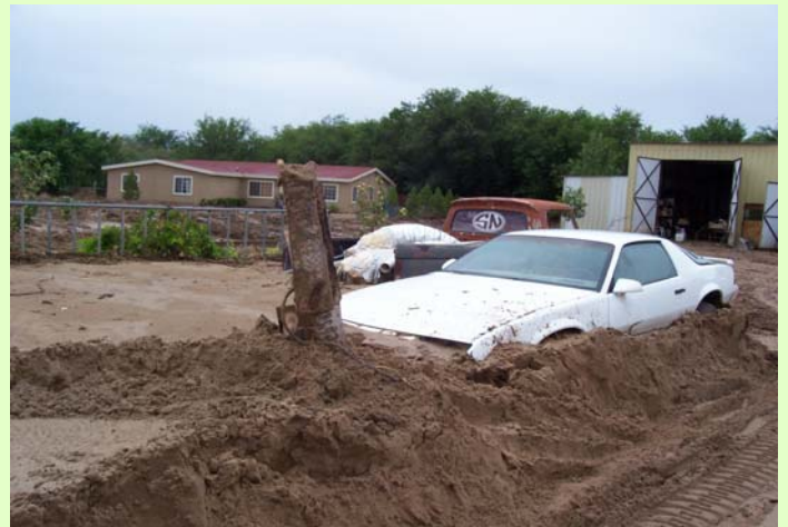
Mudslides partially bury a car and truck in Clint during the heavy rains of July 28-29.