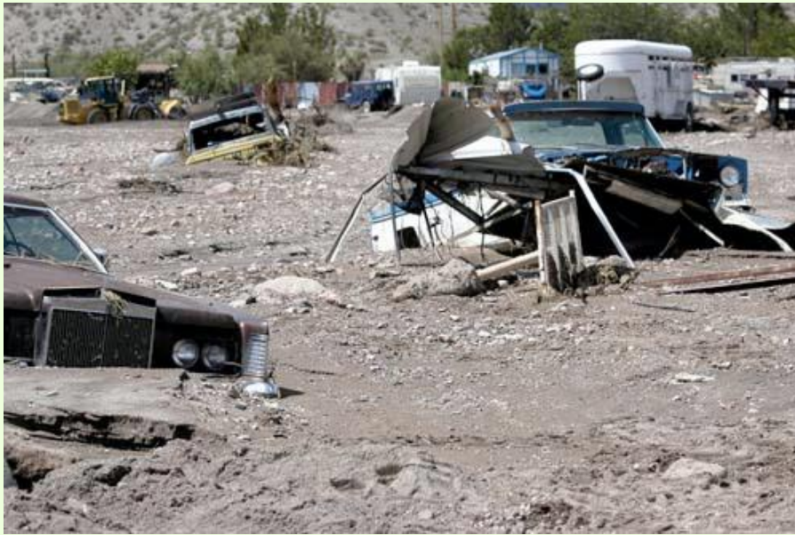
High waters from heavy rains breach the Las Placitas Arroyo three times in the summer of 2006 resulting in widespread flooding and damage in Hatch and surrounding areas.