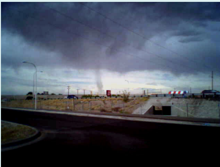
May 19 thunderstorms produce this small tornado near Las Cruces.

July 27: Evening thunderstorms wash out roads around Hueco Tanks, Clint and eastern El Paso. Lightning strikes also cause power outages across El Paso.