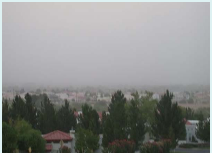
Blowing dust and low visibilities occur over Santa Teresa and west El Paso when strong thunderstorm winds blow across the area on June 22.