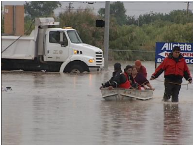
Water rescue in Canutillo

evacuate Vinton residents to higher ground. Extensive flooding also damages or destroys much of Canutillo where high waters inundate homes and close roads. The floods will make portions of Canutillo declared permanently uninhabitable by public safety officials.