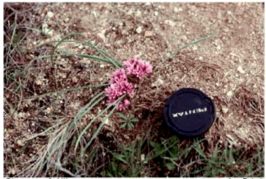
Closeup of Allium aaseae