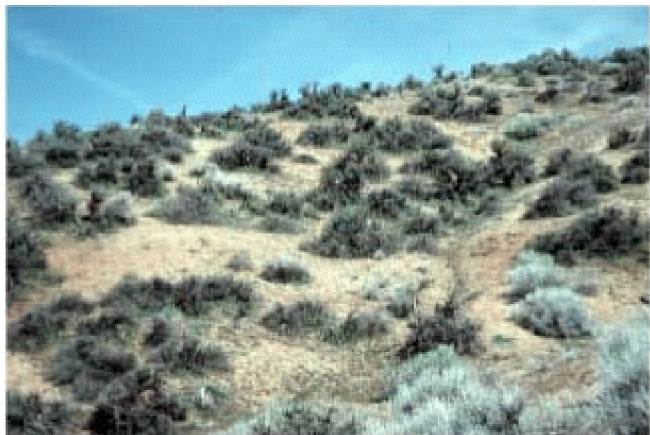
Habitat of Allium aaseae