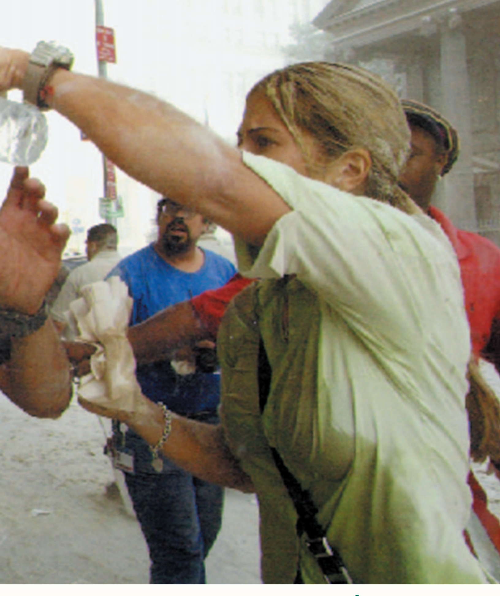
September 11, 2001