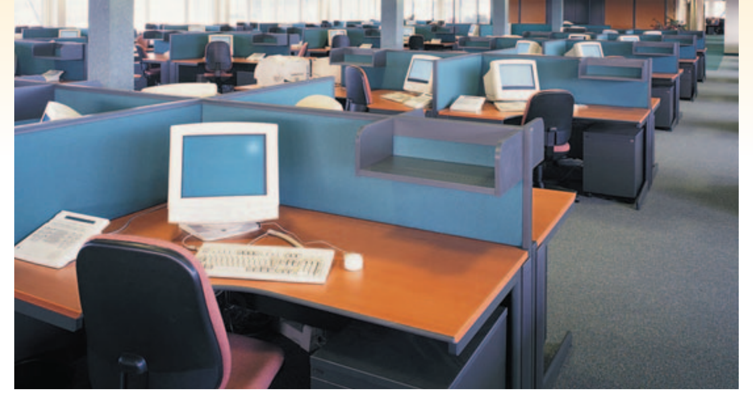
Comprehensive Furniture Management Services – GSA Schedule Number 71 II K

Let GSA manage all your furniture needs. We can design, setup, relocate, and maintain furniture for new or existing offices.