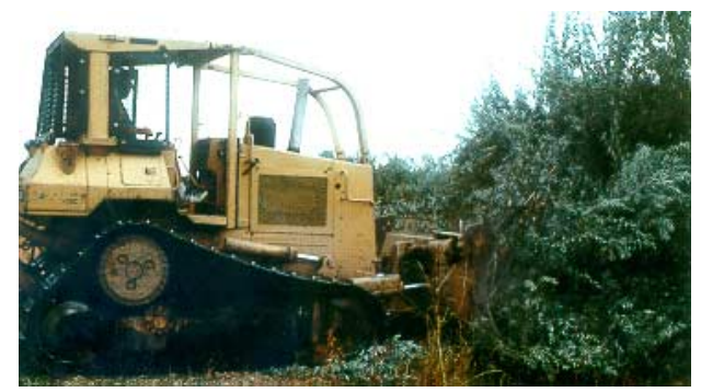
Dozing Russian-olives near Richland, WA. Severed top growth was piled and burned. Soil disturbance was considerable.

<u>Disadvantages</u>: A skilled operator is needed. Follow-up treatment will be required to control root sprouts. The spoil material must be dealt with by piling and/or burning. Burn permits may be needed and difficult to obtain. Dozing can be indiscriminant, causing damage or mortality to desirable species. Dozing leaves the soil bare and prone to erosion and weed invasion. Soil compaction and profile disturbance frequently occurs, and complicates reclaiming the site.