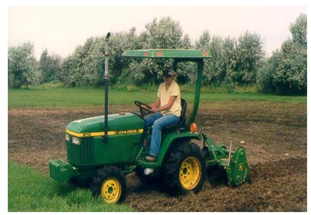
A complete seedbed preparation following removal of Russian-olive improves establishment of pastureland and hayland species.

site plants. Seed may continue to be distributed on-site from off-site sources, from animals, and from water transport (irrigation and natural waterways) after onsite removal.