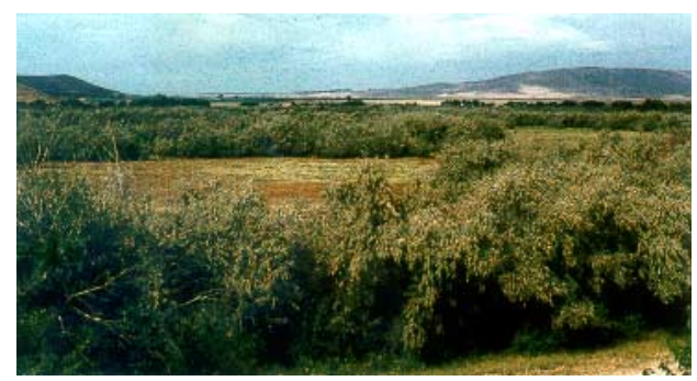
Russian-olive replaces native cottonwood and willow stands in wet saline bottomlands. Once established, Russian-olive stands are very stable.

Russian-olive and saltcedar (Tamarix pentandra Pall.) are particularly troublesome in western riparian areas (Christiansen 1962, - 1963, Carman and Brotherson 1982). Several of the larger nurseries that produce trees and shrubs for the conservation market have removed Russian-olive from their sales lists. Russianolive is not listed on the Federal Noxious Weed List. New Mexico and Colorado are the only states currently legally it as noxious (based PLANTS.usda.gov information and G. Beck comm., respectively). Utah has also listed it as a noxious weed in several counties.