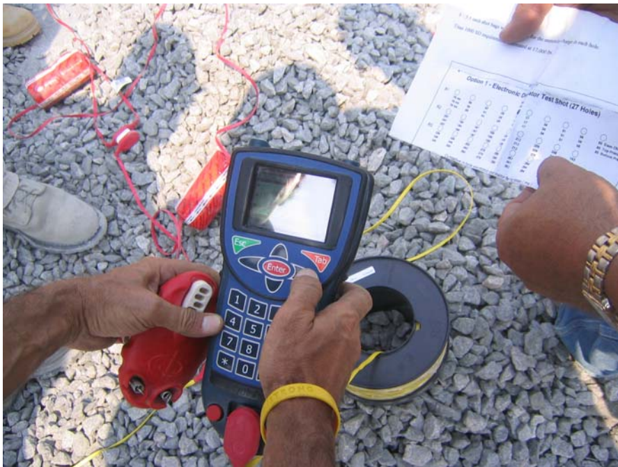
Figure 13 - Tagger report compared to written blasting plan

Prior to stemming the upper deck, the detonator rows were tested. A problem emerged when the Tagger could not detect a second detonator in the top deck of each blast hole. The version of Tagger software being used that day would not allow only three detonators to be used in a single blast hole. The Tagger generated an error signal and prevented the blaster from proceeding with the setup procedure. This event provided further verification that the Tagger could assess the condition of the circuitry in the blast column and report it accurately to the blaster. Once an additional detonator was wired to each blast hole upper deck, the Tagger verified the location of each detonator and indicated the circuits for each row and for the entire shot were as required. The blaster then used the Tagger to program the timing delays for each detonator in each column per the blast plan. A top view of the blast plan is provided on the viewing screen and the blaster can compare the shot sequencing as reported with the written blasting plan as shown in Figure 13.