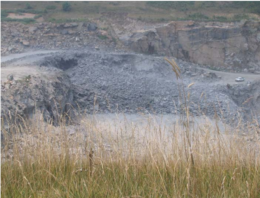
Figure 14 - Muck pile of blasted material

After verifying the shot was properly set, a two-wire lead was run from the bench controller to the blast initiation area two hundred yards away. The Tagger was inserted into the Blast Cradle and the blaster's personal HotShot Blast Key was also inserted into the Blast Cradle. The blaster entered his unique factory assigned identification number into the Blast Key to activate the Blast Cradle. The blaster performed another diagnostic on the entire blasting network and verified the shot area was properly cleared of personnel and equipment before radioing for the blast warning sirens to sound. After the third and final siren, the Blast Cradle was commanded to arm the detonators. Thirty seconds passed for the electronic arming procedure to complete and then the blast was initiated. All holes fired and there was little vibration, noise, and dust from the blast. The muck pile of blasted material is shown in Figure 14.