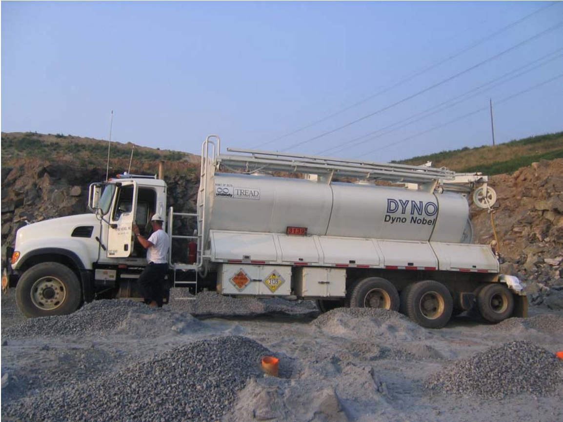
Figure 10 - Unibody emulsion truck