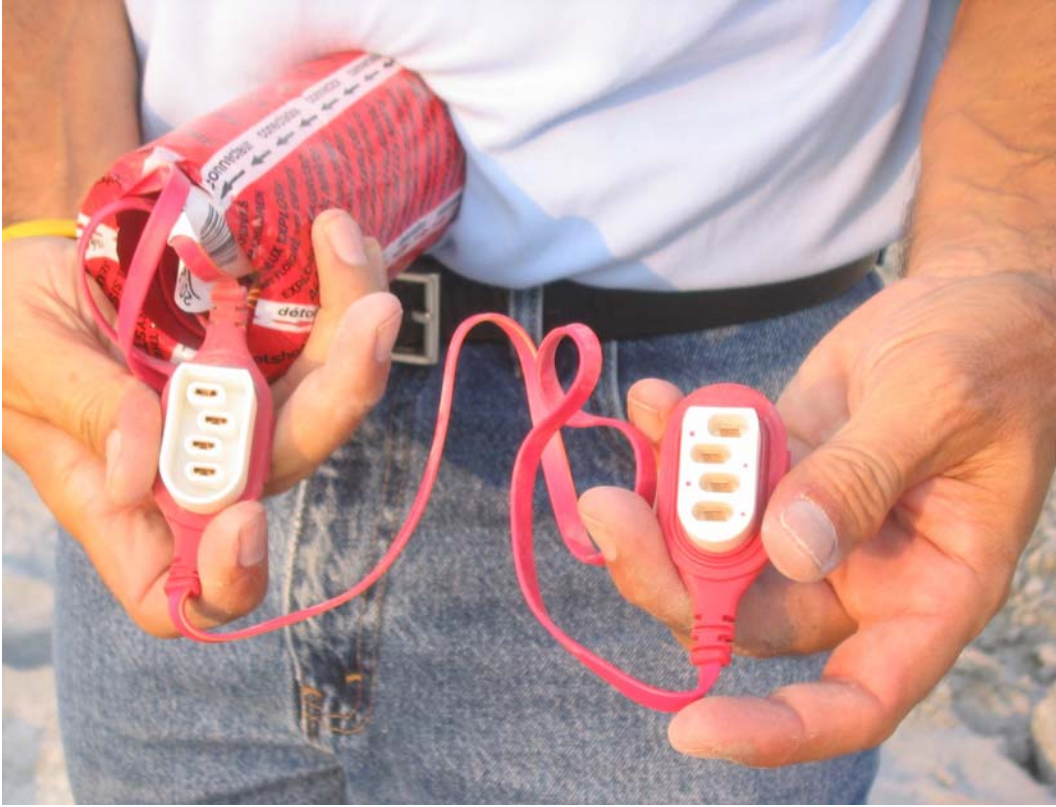
Figure 6 - HotShot connecting plugs with each spool