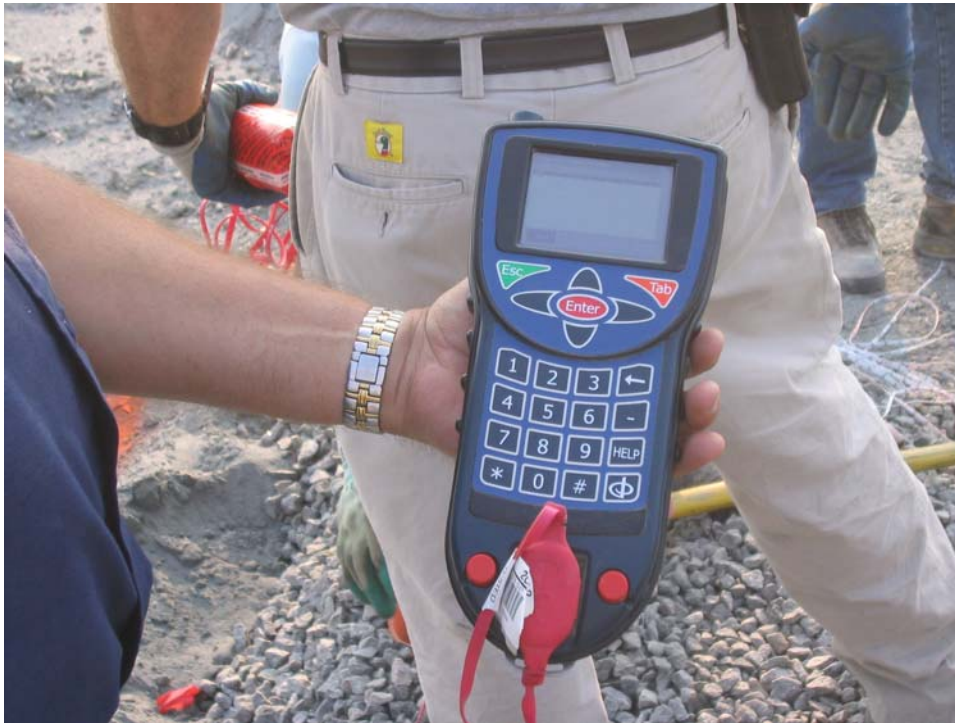
Figure 5 - HotShot Tagger showing plug connection to detonator wire

In preparing a round to be blasted, the HotShot electronic detonator is inserted into a booster to form a primer to be positioned in a blast hole powder column. Once the primers are positioned and the powder charge added, the condition of each detonator is tested using the HotShot Tagger at the borehole before the hole is stemmed. The detonator wire is plugged into the receptacle on the Tagger, as shown in Figure 5 and the detonator circuitry is tested for short circuits, open circuits, and operational integrity. Once these tests have been made, the connection plug is removed from the Tagger and the steps are repeated for each electronic detonator in the blast hole powder column before stemming.