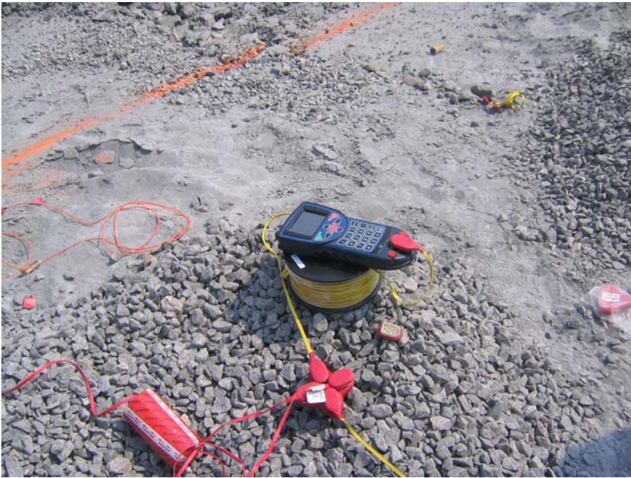
Figure 7 - Bench controller connects all rows and branches on bench