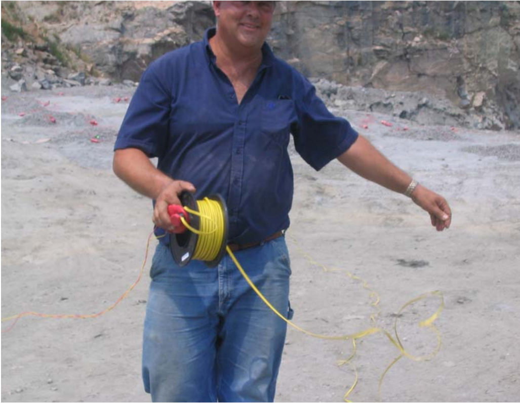
Figure 8 - Two-wire lead interfaces with four-wire lead at bench controller