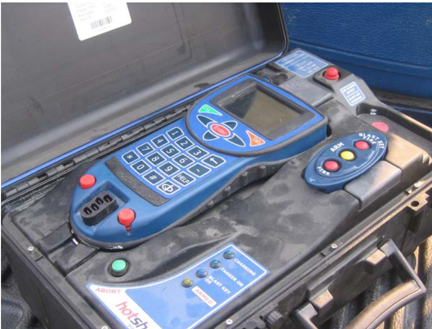
Figure 9 - HotShot Tagger inserted in Blast Cradle with Blaster's Key