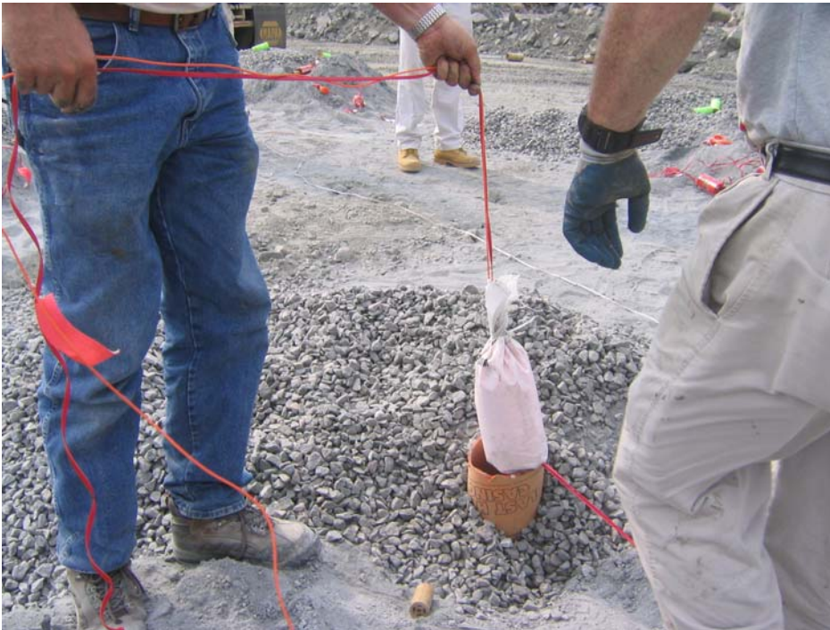
Figure 12 - Inserting top deck charge into blast hole