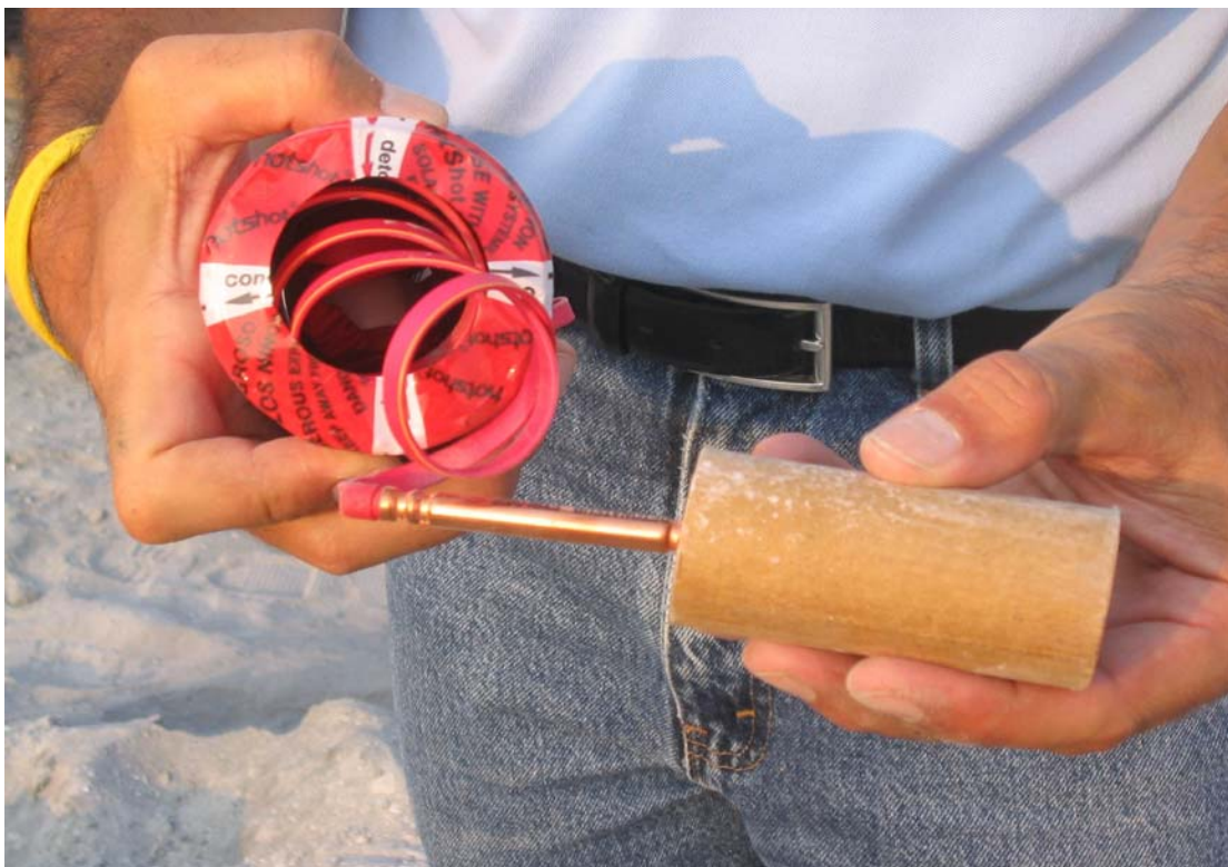
Figure 4 - HotShot electronic detonator, cardboard sheath and connecting wire