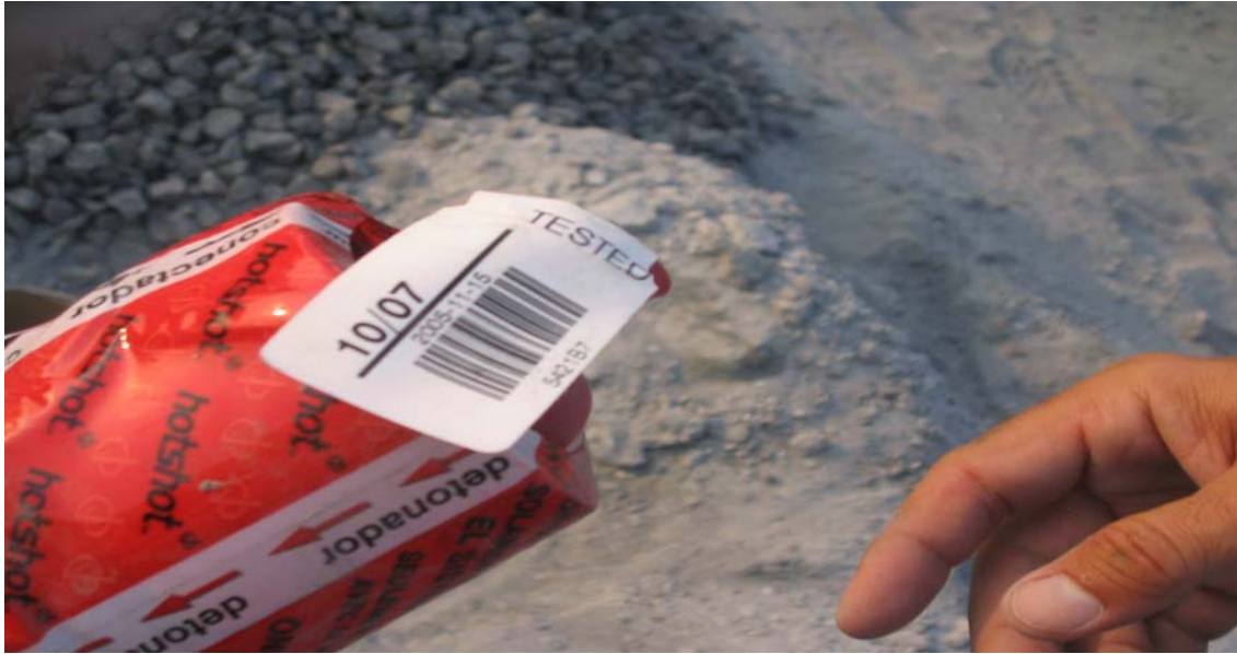
Figure 3 - The HotShot electronic detonator with identification tag on spool