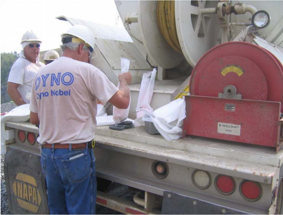
Figure 11 - Preparing upper deck charge at emulsion truck