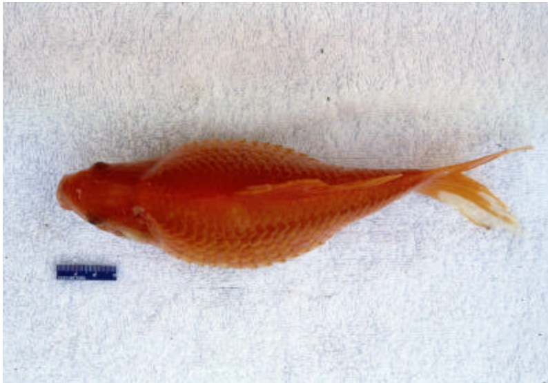
Figure 2: Severe distention and accumulation of ascites in the abdomen of a goldfish ( Carassius auratus ) caused by Aeromonas hydrophila . Also note the “washboard” effect of the dermis caused by the protrusion of scales from the body surface.

Systemic infections were characterized by diffuse necrosis in several internal organs and the presence of melanin-containing macrophages in the blood (Ventura and Grizzle 1988). Internally, the liver and kidneys are target organs of an acute septicemia. The liver may become pale or have a greenish coloration while the kidney may become swollen and friable. These organs are apparently attacked by bacterial toxins and lose their structural integrity (Huizinga et al. 1979). Even when tissue damage in the liver and kidneys is extensive, the heart and spleen are not necessarily damaged. However, splenic ellipsoids are often centers of intense phagocytic activity