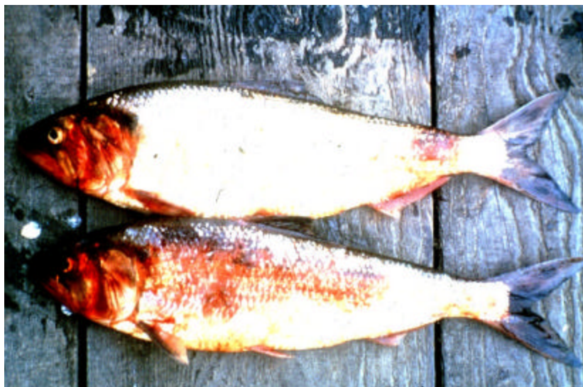
Figure 4: Hemorrhage and ulcerations caused on the dermis of American shad