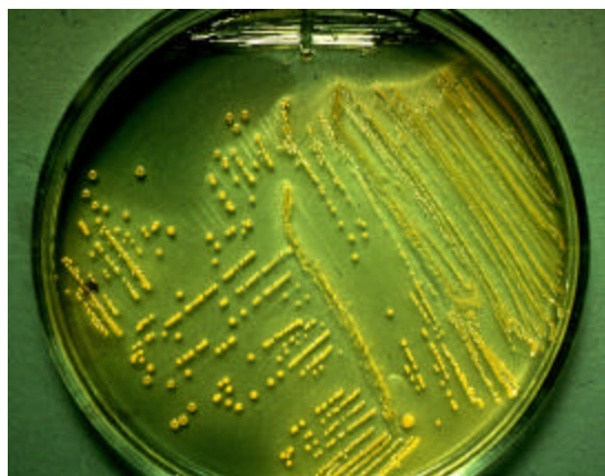
Figure 5: Growth of yellow colonies that are characteristic of Aeromonas hydrophila after incubation on Rimler-Shotts agar.

medium for selective isolation of motile aeromonads. This medium, termed R-S agar, is prepared by dissolving the following ingredients (grams) in distilled water to a volume of 1 liter: L-lysine hydrochloride (5.0), L-ornithine hydrochloride (6.5), L-cystine hydrochloride (0.3), maltose (3.5), sodium thiosulfate (6.8), bromothymol blue (0.03), ferric ammonium citrate (0.8), sodium deoxycholate (1.0), novobiocin (0.005), yeast extract (3.0), sodium chloride (5.0), and agar (13.5). The mixture is constantly stirred, heated to boiling for 1 min, and brought to pH 7.0. The medium is cooled to 45°C, dispensed into sterile petri dishes, and can be refrigerated in plastic sleeves until used.