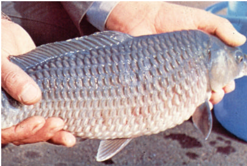
Figure 1 : Scale protrusion on a carp ( Cyprinus carpio ) caused by Aeromonas hydrophila

In the acute form of disease, a fatal septicemia may occur so rapidly that fish die before they have time to develop anything but a few gross signs of disease. When clinical signs of infection are present, affected fish may show exophthalmia, reddening of the skin, and an accumulation of