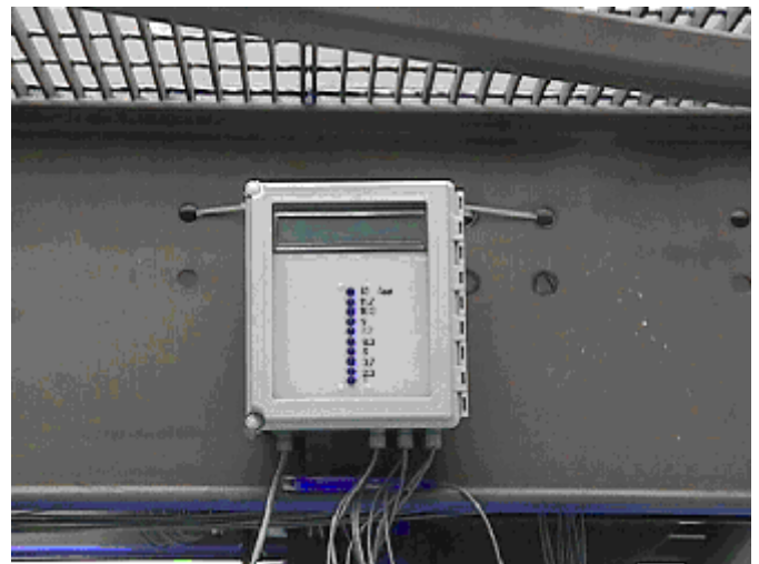
Figure 3.—Level indicator with LED's showing presence or absence of material at each gage.