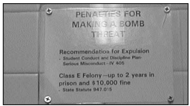
Signs should clearly communicate to students the prohibition against and penalties for making bomb threats.

7. Fostering a positive school climate, free of aggression. Considerable research has been conducted in the United States and elsewhere on the effectiveness of using a "whole school approach" 23 to reduce acts of violence and aggression. The overall social and moral climate of the school can have significant effects on reducing school violence. Other approaches have also demonstrated a reduction in the amount of school disruption and violence. These include those targeted at anger management, adolescent positive choices, conflict resolution, classroom behavior management, and antibullying programs.<sup>24</sup> However, the effectiveness of these approaches varies according to school locality, and they are usually more effective if targeted at high-risk students.<sup>25</sup> Peer mediation and counseling has generally not been found effective in reducing problem behavior. And in the case of drug use, instruction by law enforcement officers concerning the legal penalties and negative effects of drug use have not been found effective.<sup>26</sup> Thus, you will need to research with the school the appropriate type of intervention that fits its needs. The following guidelines are recommended: