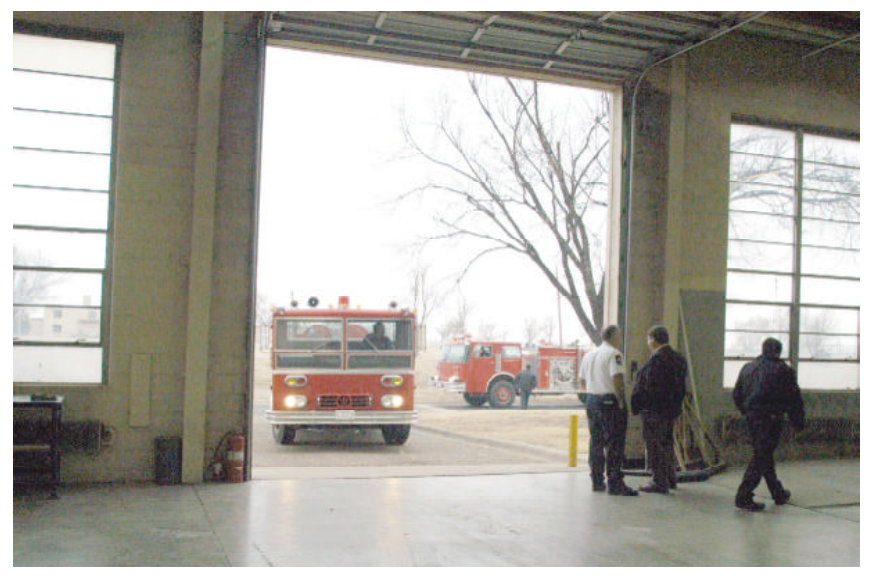
COLLEGE LOAN: Pantex firefighters deliver two engines to Amarillo College. The engines will be used to train firefighters at the college and Pantex.

Pantex often loans equipment to local fire agencies. This is the first time firefighting equipment has been loaned to an educational institution.