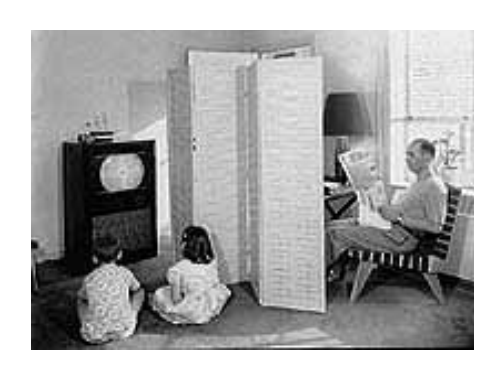
Father reading newspaper, two children viewing television. New York City, July 1950.