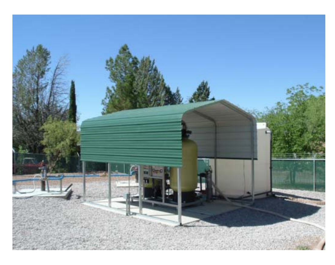
Figure A-6. Rimrock, AZ Treatment System