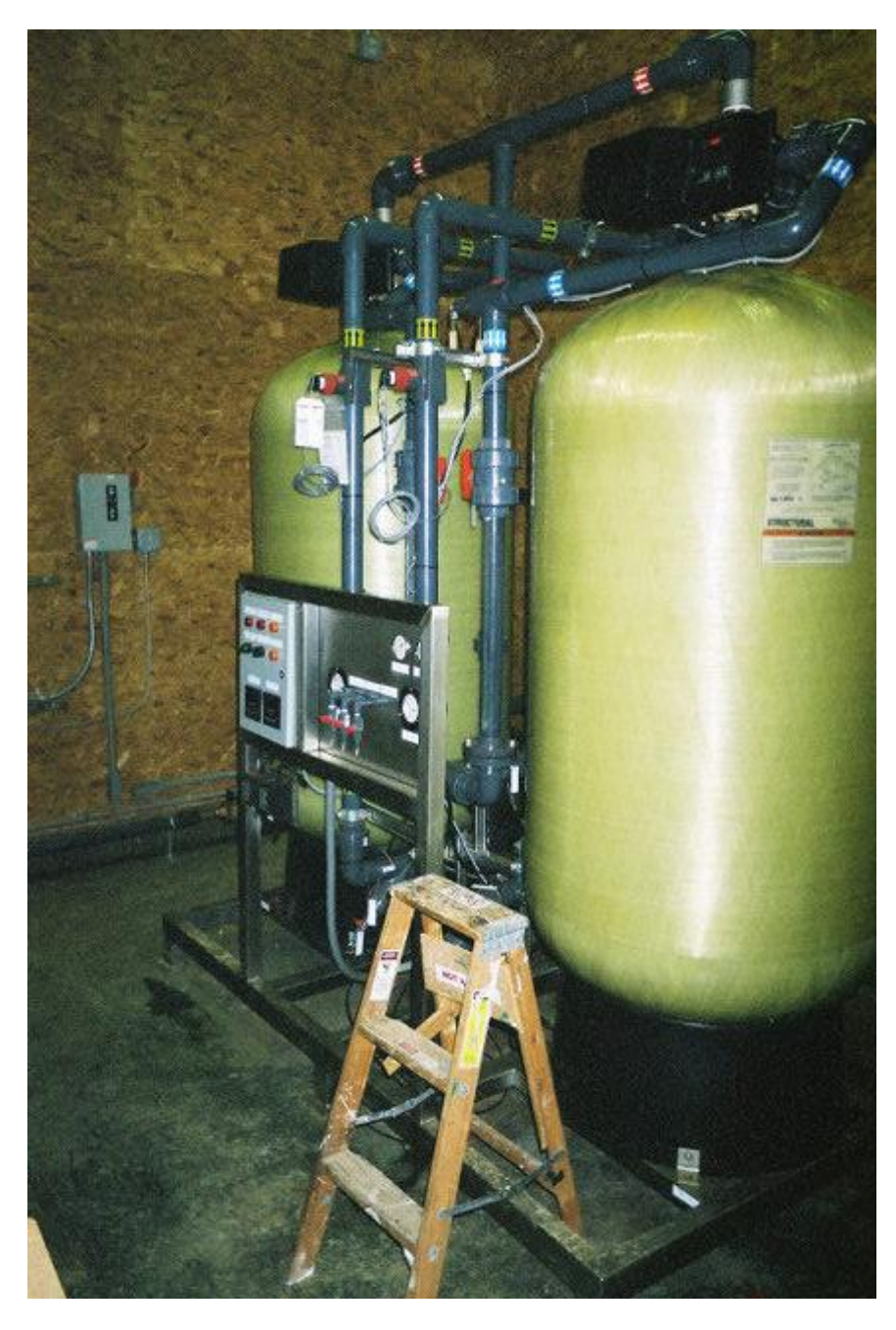
Figure A-7. Rollinsford, NH Treatment System