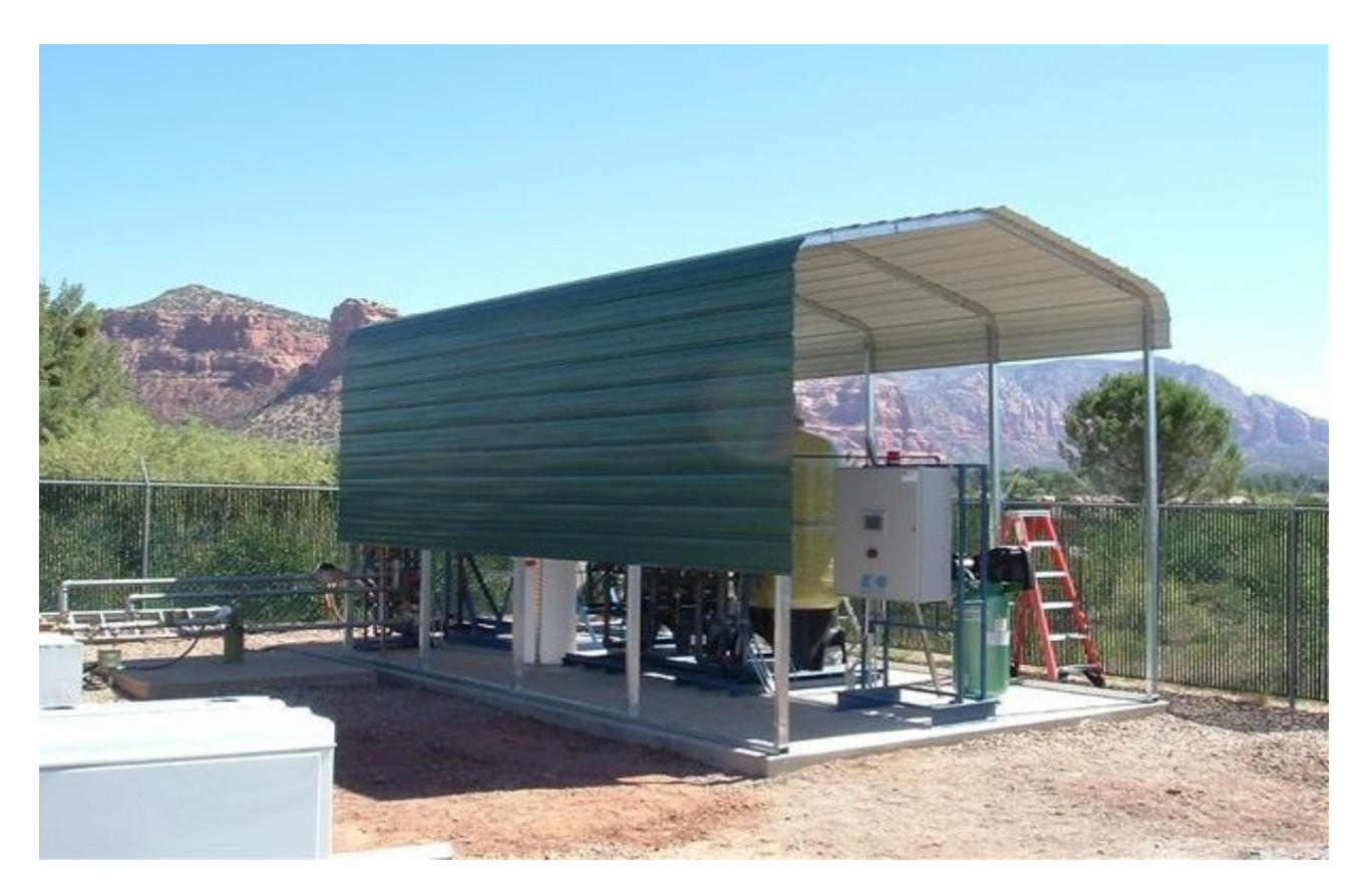
Figure A-8. Valley Vista, AZ Treatment System