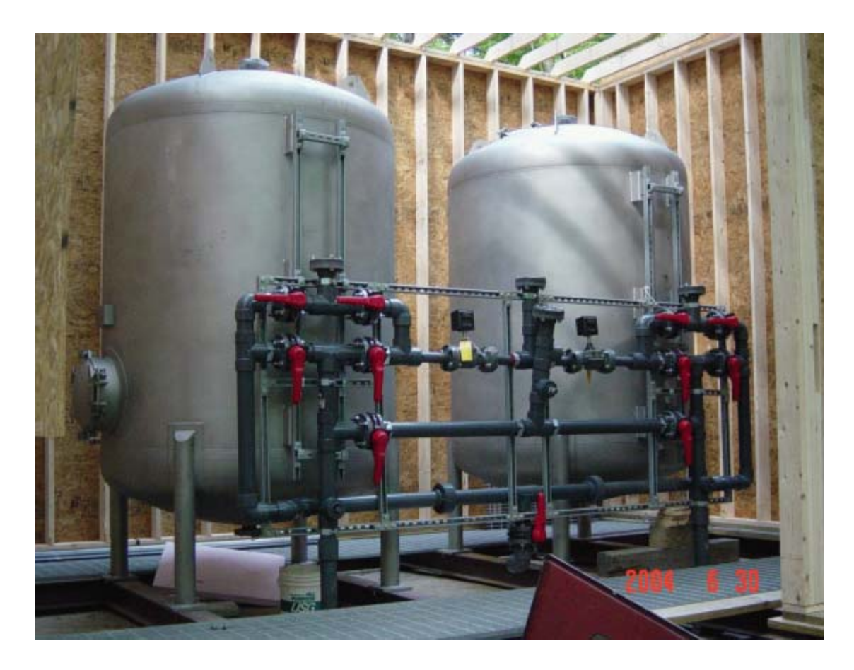
Figure A-1. Bow, NH Treatment System