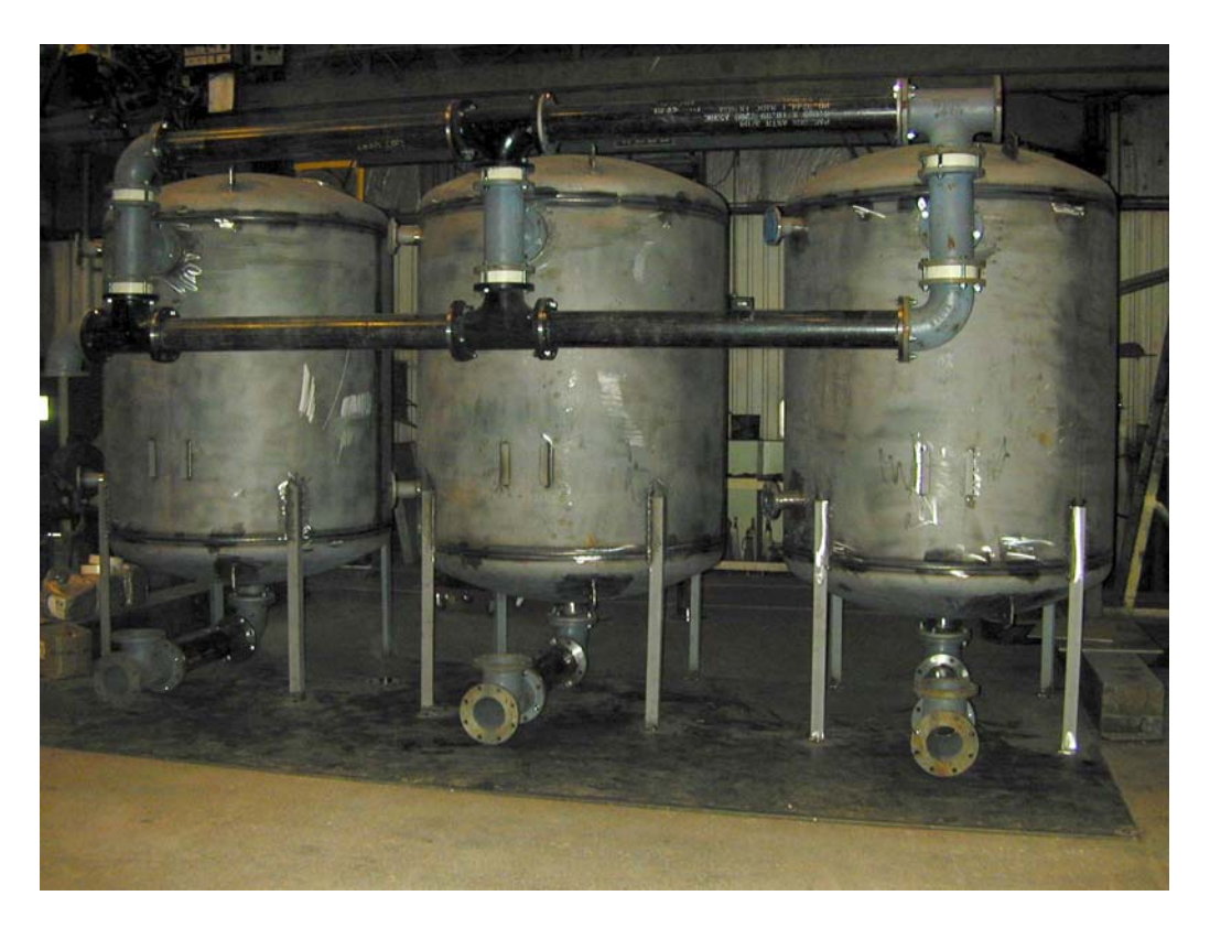
Figure A-9. STMGID, NV Treatment System (Photograph Taken in the Shop)