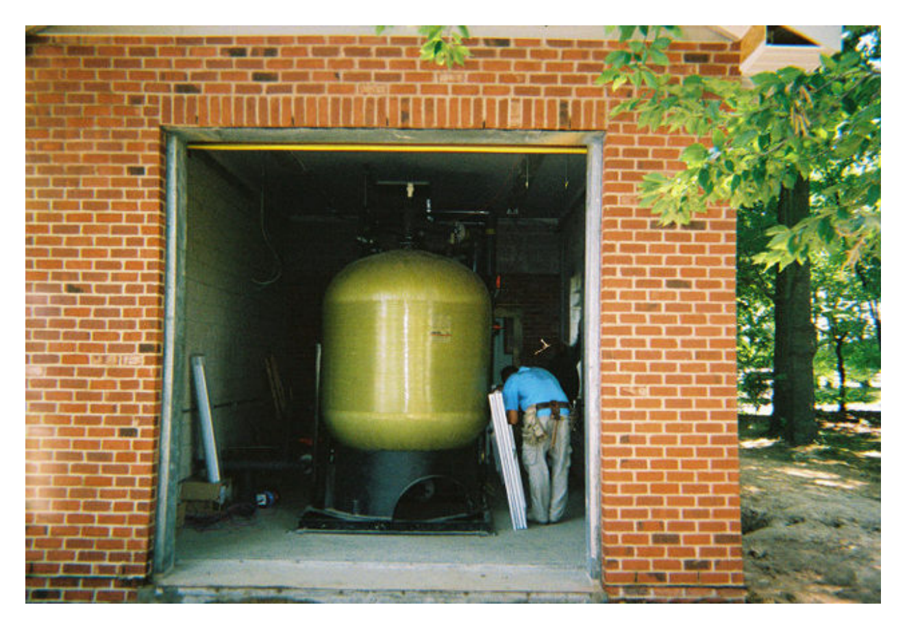
Figure A-4. Queen Anne's County, MD Treatment System