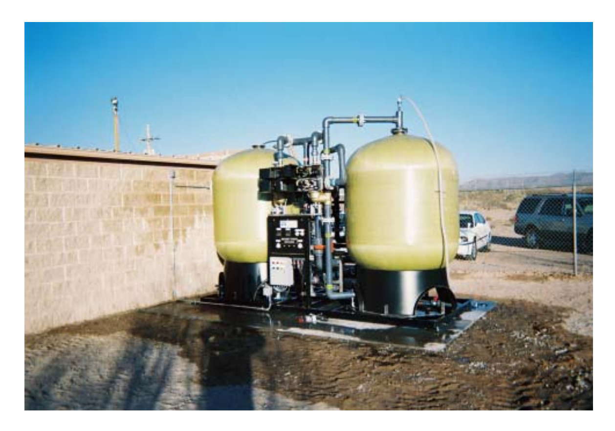
Figure A-2. Desert Sands MDWCA, NM Treatment System