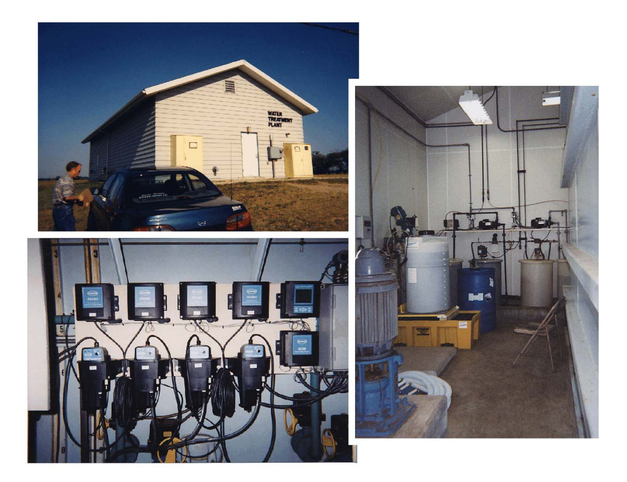
Figure A-12. Lidgerwood, ND System Modification (Iron Addition System)