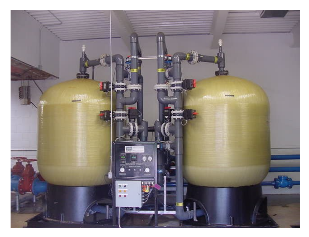
Figure A-3. Brown City, MI Treatment System