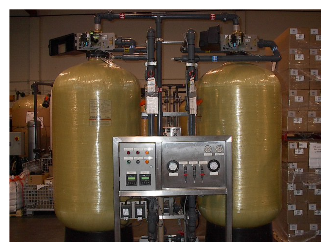
Figure A-5. Nambe Pueblo, NM Treatment System (Photograph Taken before Shipment)