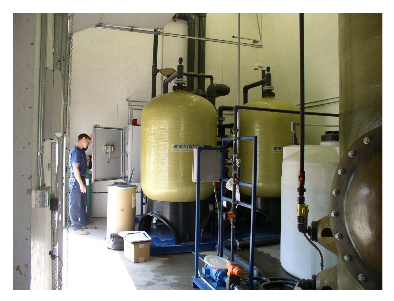
Figure A-11. Fruitland, ID Treatment System