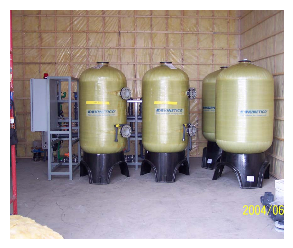
Figure A-10. Climax, MN Treatment System