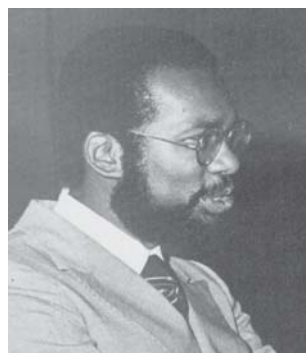
Photos (top and bottom): Ernest Green on graduation day, May 25, 1957 at Quigley Stadium, Central High School. Ernest Green, ca. 1980s.