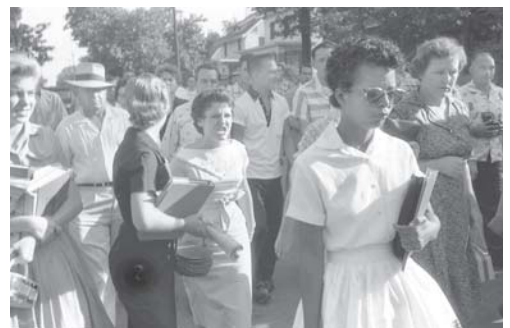
Elizabeth Eckford being followed by a hostile crowd on September 4, 1957.

Ties to US Civics Frameworks: (grades 5-8) NSS-C.5-8.1, NSS-C.5-8.3, NSS-C.5-8.5; (grades 9-12) NSS-C.9-12.1, NSS-C.9-12.3, NSS-C.9-12.5.