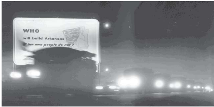
Members of the 101 st Airborne from Fort Campbell, Kentucky, enter Little Rock on September 24, 1957

The Little Rock School Board asked Judge Davies to temporarily suspend his desegregation order, but the judge refused and ordered the school district to proceed with desegregation. The judge also instructed the U.S. Attorney General to file a petition for an injunction against Governor Faubus and two officers of the Arkansas National Guard