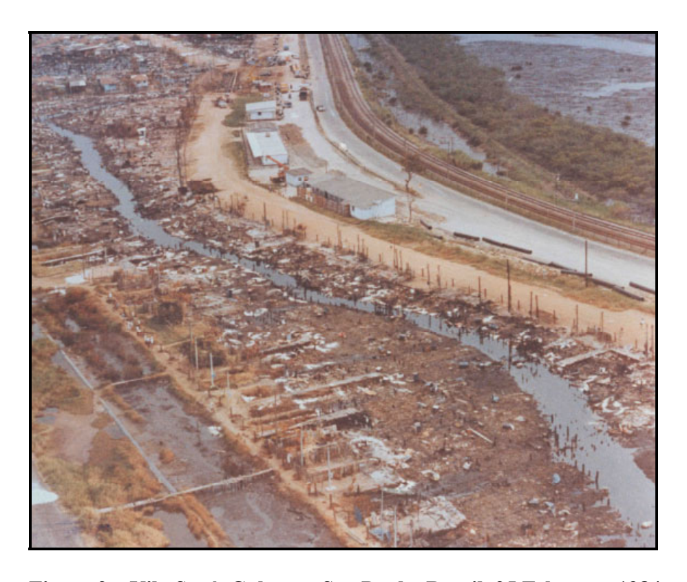
Figure 2 – Vila Socó, Cubatão, São Paulo, Brazil, 25 February 1984

One of the most serious accidents related to pipeline oil transportation occurred in 1984 when a major spill of some 700,000 liters (184,800 gallons) of gasoline caused a fire in Cubatão, São Paulo, Brazil. The leak occurred in an 18-in. pipeline located near the shantytown of Vila Socó, where approximately 8,000 people lived. The fire, which lasted almost 10 hours, started in the early morning, but the gasoline leak had been perceived by some of the residents at least two hours before the fire began. There are some reports that residents had begun to collect and stockpile the spilled gasoline in their homes. The fire resulted in the complete destruction of an area of 100,000 m², nearly 75% of the shantytown. The bodies of 67 persons – almost all burned beyond recognition – were recovered from the ruins of their homes. Among the more than 200 seriously injured, many were unable to survive the severity of their burns and died. In any event, the number of fatalities commonly attributed to the fire (508) exceeds by a considerable margin the official number of fatalities.