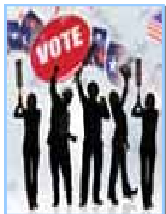
USA Elections in Brief

http://usinfo.state.gov/products/pubs/elections-in-brief/