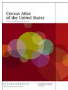
Census Atlas of the United States

http://www.heritage.org/research/features/index/