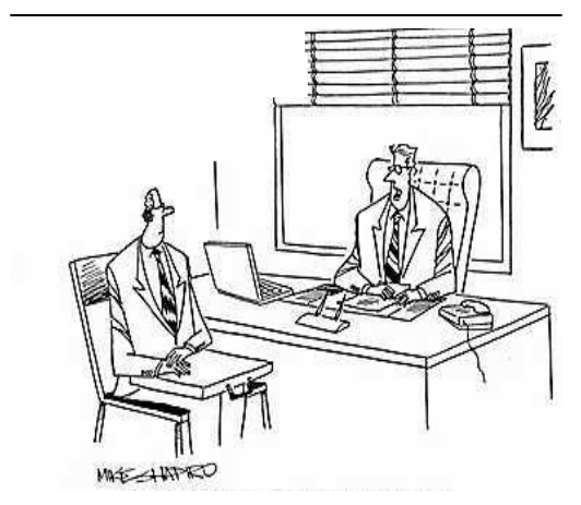
"We're not looking for someone with good leadership qualities, but for someone with good herding instincts"

This type of style involves the leader including one or more employees in on the decision making process (determining what to do and how to do it). However, the leader maintains the final decision making authority. Using this