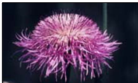
Texas Thistle FWS Photograph