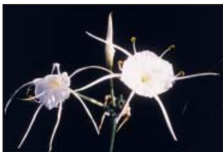
Spider Lily