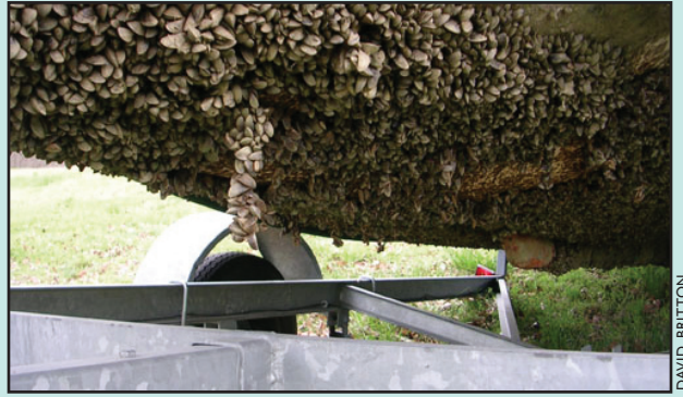
Hull of a sailboat encrusted with zebra mussels