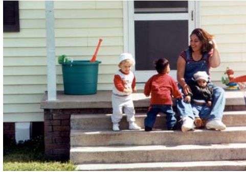
The small white box left of the porch is the only outdoor evidence of the new GHP system that provides heating, cooling, and hot water in this military family residence.

If designed properly, GHPs save energy and cost less to maintain.