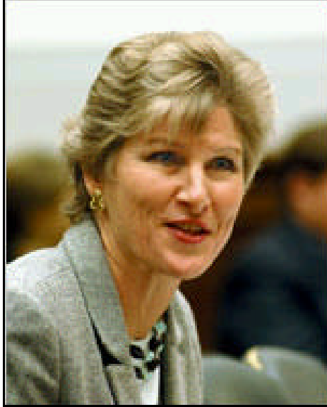
Karen Hughes Under secretary of State for Public Diplomacy and Public Affairs

Washington – When women have access to education, capital and health care, they not only improve the well-being of their own families but the stability of their communities, said Karen Hughes, under secretary of state for public diplomacy and public affairs, at the International Women's Leadership Conference in Honolulu on August 29.