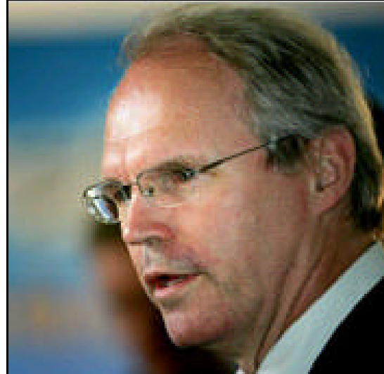
Ambassador Christopher Hill

In both Tokyo and Beijing, Hill said, he discussed U.N. Security Council Resolution 1695. The U. N. Security Council unanimously adopted the resolution - its first