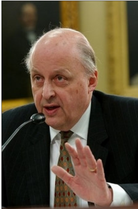
Deputy Secretary of State John Negroponte testifies on Capitol Hill in Washington, Thursday, March 6, 2008, before a House Appropriations subcommittee hearing

In Iraq, he said, a surge in coalition forces during 2007 improved security conditions and created new opportunities to help the Iraqi people. With $679 million, the United