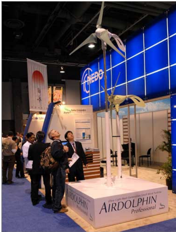
Japan's Zephyr small wind turbines supply power to private homes and commercial spaces.

New Zealand committed to produce 90 percent of its electricity from renewable sources by 2025; Madagascar committed to 54 percent by 2020. The Council of the European Union said it would push for a minimum reduction in greenhouse gas emissions of 20 percent by 2020.