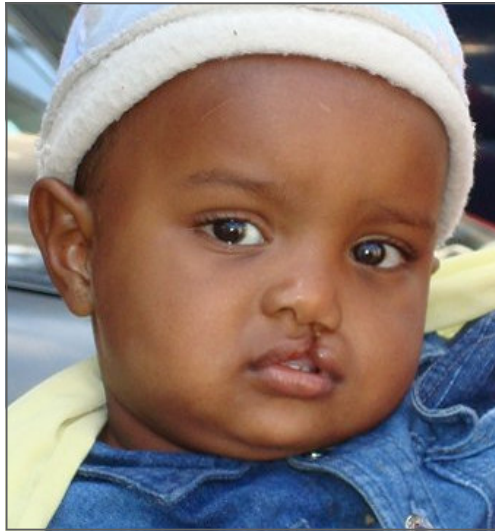
An Ethiopian child who was selected for the surgery in the 2007 Operation Smile project in Ethiopia