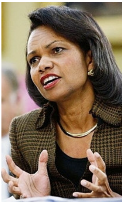
Secretary of State Condoleezza Rice