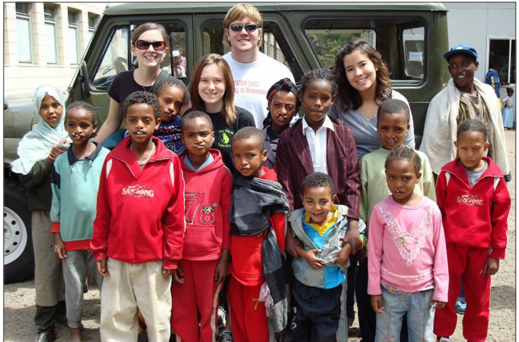
Medical Team pose for photo with Ethiopian children who were screened for treatment.. 238 Ethiopians benefit from Operation Smile, a worldwide children's medical charity mission in Ethiopia in November 2007. Out of the total beneficiaries, 111 were treated at the Black Lion Hospital in Addis while 127 underwent surgery at the Jimma University Specialized Hospital in Jimma.

Another Operation Smile mission in Amman, Jordan, treated Jorda-