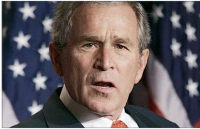
President George W. Bush

In a separate statement issued in Washington, Secretary of State Condoleezza Rice said "there is no cause that could ever justify this