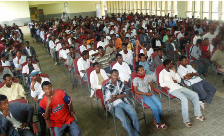
Partial view of the audience watching the American Civil Rights Movement Years film at Harar Teachers Training and Business College

Dawa. Over one thousand audience members watched film shows in both towns and the program was well received. The film shows were made possible by the positive cooperation of our American Corner library partners, the Alliance Française Dire Dawa, Dire Dawa University and the Law Faculty of Haramaya University. ♦