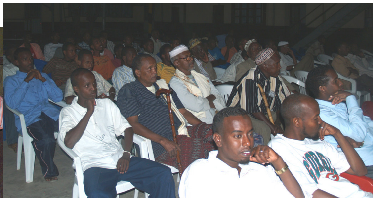
Partial view of the audience watching "The Muslim Americans" film in Dire Dawa.