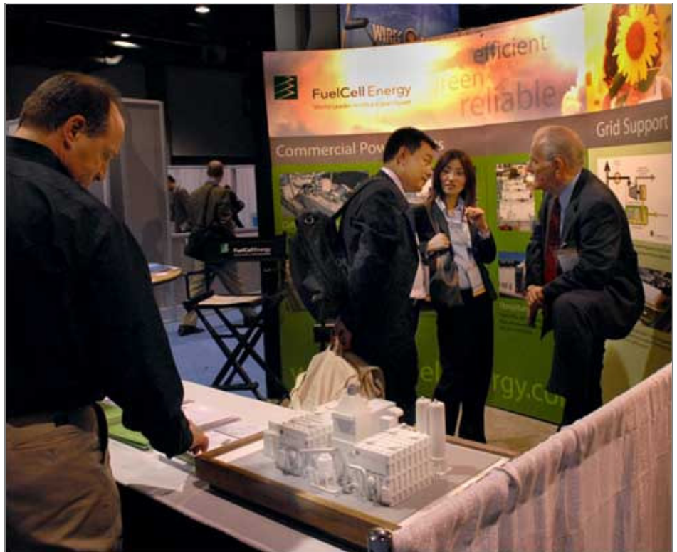
Delegates discuss renewable energy possibilities at WIREC trade show.

The president said he aims "to reduce our dependence on oil by investing in technologies that will produce abundant supplies of clean and renewable energy and at the same time show the world we are good stewards of the environment."