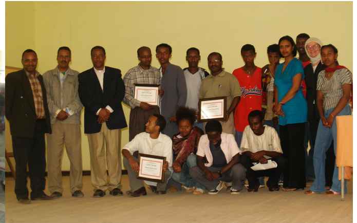
Award Prize recipients with their school headmasters, officials and Embassy representatives in Harar.