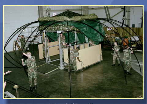
"Hospital in a Box"

Advanced Amphibious Assault Vehicle (AAAV)