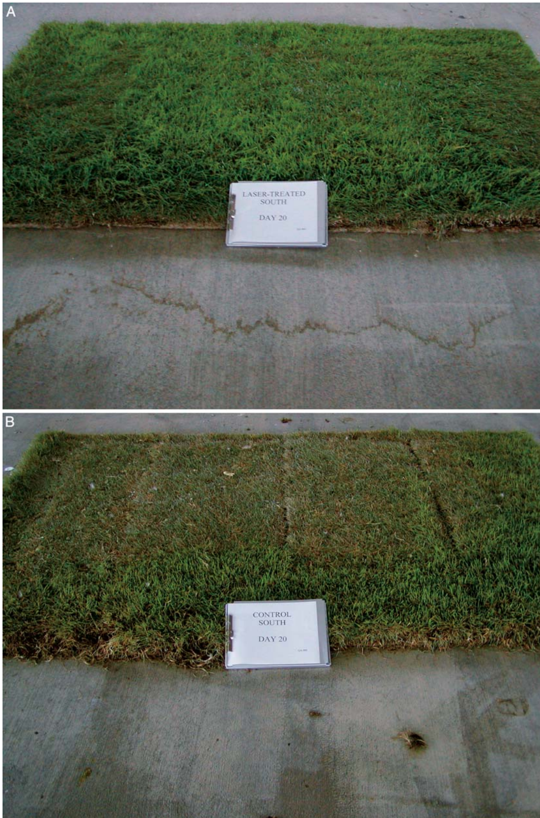
Figure 3. Grass sod from a laser-hazed (A) and control (B) subplot subsequent to the 20-day habituation test of a laser hazing system for repelling Canada geese.