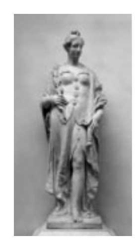
Barthélemy Prieur (pronounce: pree-yur) French, 1536–1611

Jean-Baptiste Tuby (pronounce: tew-bee), French (born in Rome), 1635–1700, Cherubs Playing with a Swan , 1672/1673, lead with traces of gilding, height 1.19 m (47 in.). Andrew W. Mellon Collection 1940.1.15