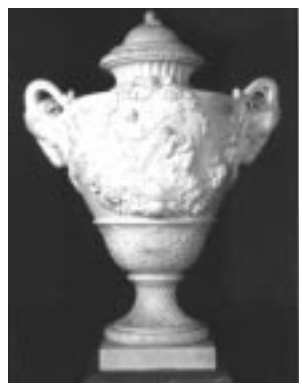
Claude Michel, called Clodion Pair of Monumental Urns

Clodion prepared a terra cotta model for Poetry and Music , which is in the National Gallery and frequently on view in the ground-floor sculpture galleries. It provides a rare chance to compare an artist's model with the final version in stone. In this case, Clodion modified the figure of poetry, "correcting" it to adhere to traditional representations: the terra cotta figure had rested his head in his hand, but here he holds a writing stylus.