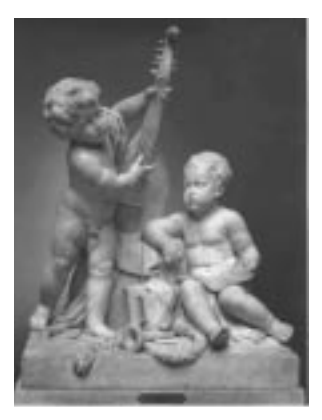
Claude Michel, called Clodion (pronounce: clo-dee-awn) French, 1738–1814

Terray is representative of the private patrons who transformed the monumental public works of the preceding century into the more intimate works admired by eighteenth-century collectors. He was among the most unpopular of all Louis XV's ministers, accused of excessive luxury. When he was swiftly dismissed by the new king after Louis XV's death in 1774, a Parisian mob burned him in effigy. Public opinion notwithstanding, he seems to have tried to make much needed economies in public spending, to reform taxes, and reduce bloated state pensions.