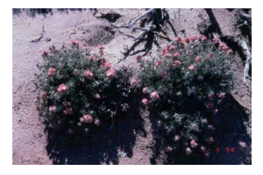
Sphaeralcea coccinea growing in contaminated soil near Anaconda.