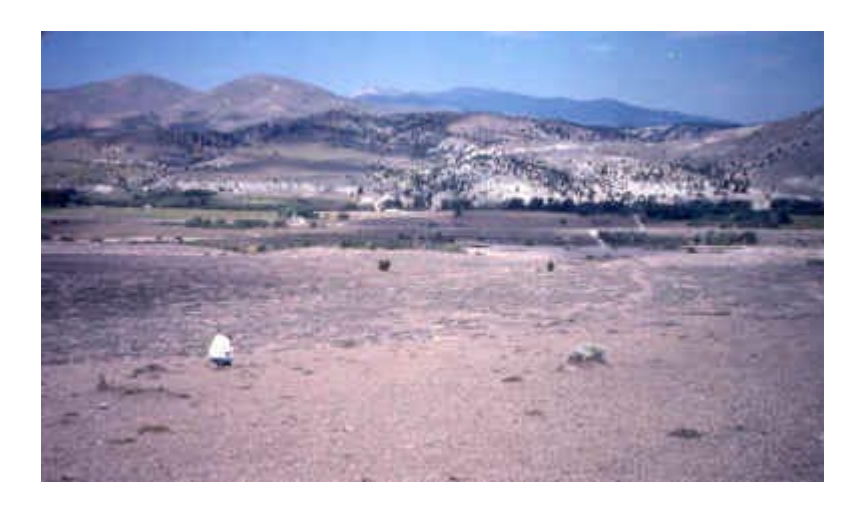
Collecting Heuchera parvifolia above the Moto-X northeast of Anaconda.