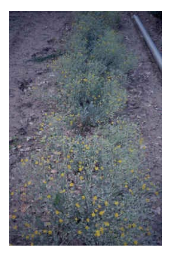
Potentilla hippiana being grown for seed at the Bridger Plant Materials Center.