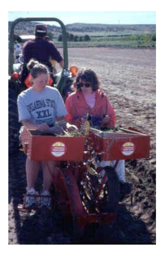
Transplanting containers using a Mechanical Transplanter.