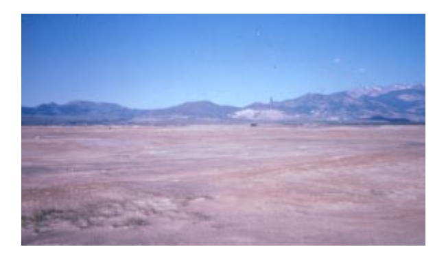
View of Opportunity Ponds looking at the Southwest.