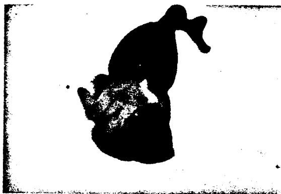
FIG. 2. Adult female nematodes in a partially dissected gaster of a worker fire ant, S. invicta . X 32.

The adult nematodes measure 1.2 mm to 1.4 mm in length and ca. 0.17 mm in diameter. From 17 to 35 were dissected from the gasters of large workers. These rather thick-bodied nematodes contained eggs throughout their bodies. The juveniles measure ca. 0.15 mm in length, the eggs slightly less than 0.04 mm in diameter. At least 1,000 eggs and juveniles (total) were present in large workers. W.R. Nickle, U.S.D.A., ARS, Beltsville, MD,