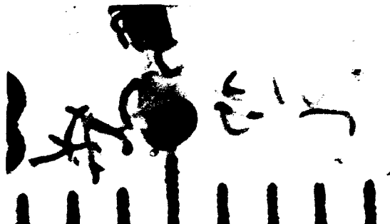
FIG. 3. Adult female nematodes dissected from the gaster of a worker fire ant, S. invicta . Divisions are in mm. X 15.

observed a small adult male nematode in a worker ant.