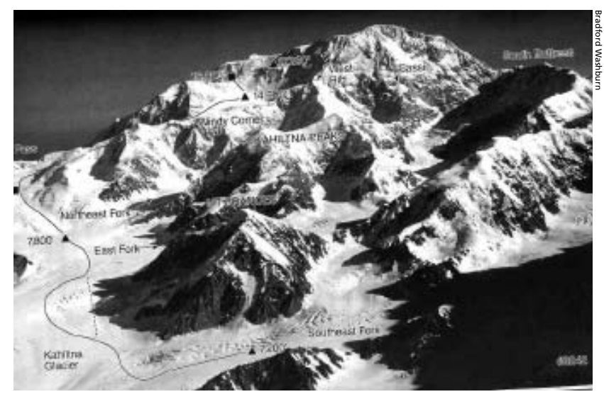
The West Buttress route.

unable to find information elsewhere you can direct specific questions to the Talkeetna Ranger Station.