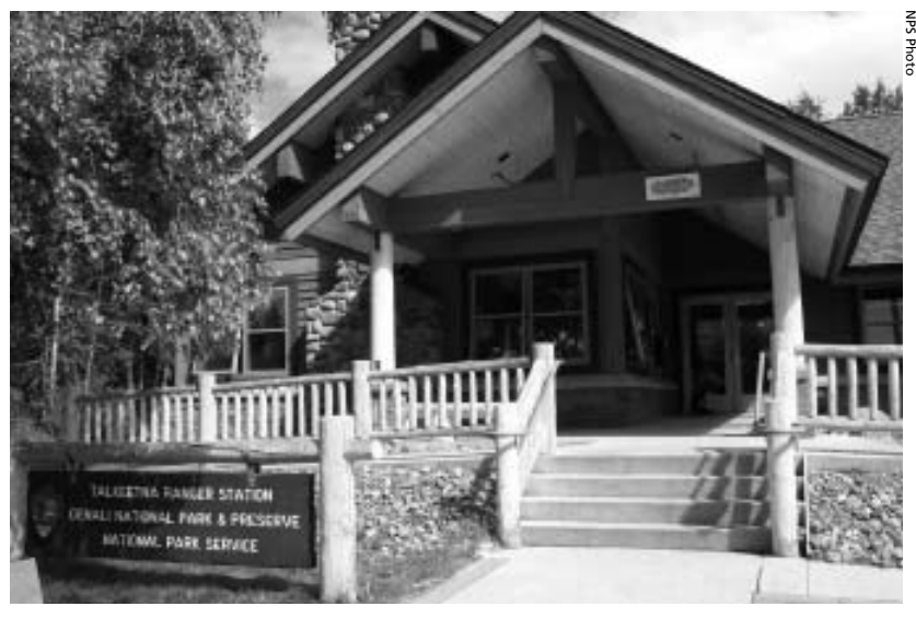
The Talkeetna Ranger station offers assistance to mountaineers year-round.

A collection of over 150 high quality photographs of the Central Alaska Range by Bradford Washburn is available for viewing at the ranger station. The station maintains a reference library including a complete set of American Alpine Journals, a map collection, and specific route information for numerous other peaks, including the Ruth, Kitchatnas and Little Switzerland. While in Talkeetna, please feel free to use all of these resources to better prepare for your climb.