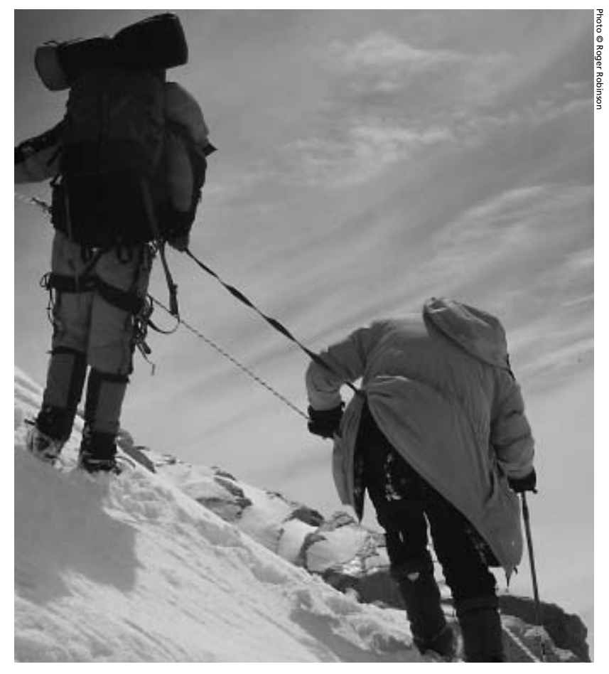
When High Altitude Pulmonary Edema (HAPE) is suspected, descent is mandatory and may be lifesaving.

"With five people crammed in the tent, morale decreased rapidly. There was no interest in cooking meals and by the next day no one was even interested in melting drinking water. We found ourselves very apathetic...not caring whether or not we got enough to drink or eat or if our gear was wet...we just lay there and waited with little or no sleep...by morning the cold had taken its toll...Jerry Lewis and I had numb feet and I had numb fingers."