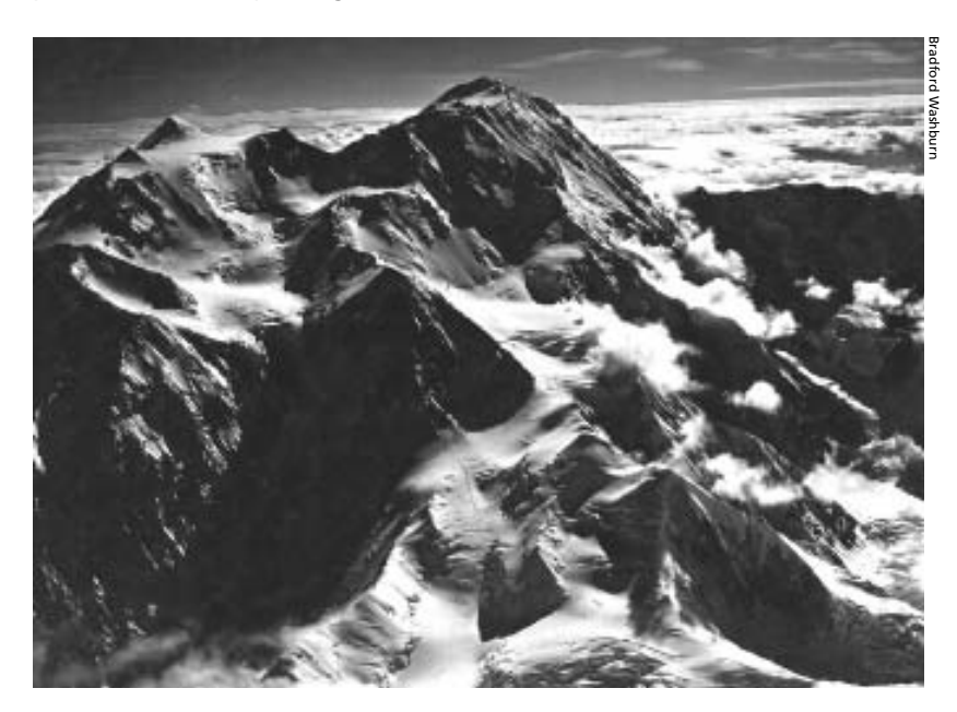
The western side of Denali.

Standard sleeping medications should be avoided above 10,000 feet (3000 meters). Sleep medications cause a decrease in the respiratory response, lowering blood oxygen levels, which can cause Acute Mountain Sickness (AMS). Diphenhydramine or acetazolamide are the drugs often prescribed for sleep at high altitude.