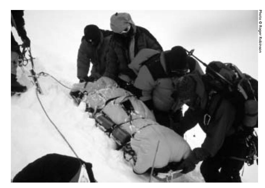
Climber lowered down West Rib.

Prevention is always easier than treatment when it comes to frostbite or