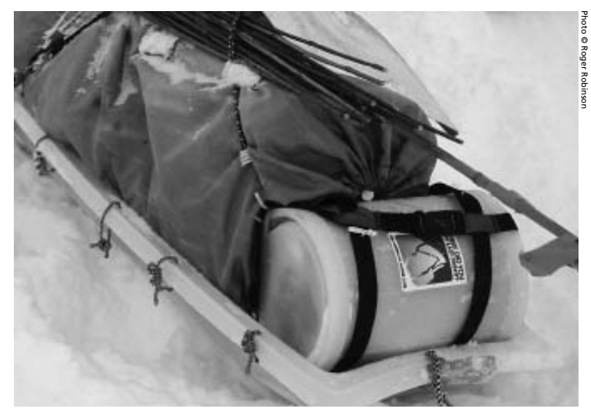
Sleds can be used to shuttle loads during the climb or to evacuate sick or injured climbers.

Sleds or sacks have proven very useful for travel on the lower glaciers and for shuttling loads. A single climber can pull loads of 30 to 40 pounds (14 to 18 kg) with little difficulty. Most Denali climbers use lightweight plastic sleds available from department stores or through the Talkeetna based air services. Sleds can be rigged with rope breaks on the descent. Sleds and sacks can be used for carrying garbage on the descent. They may also be used for evacuating sick or injured climbers.