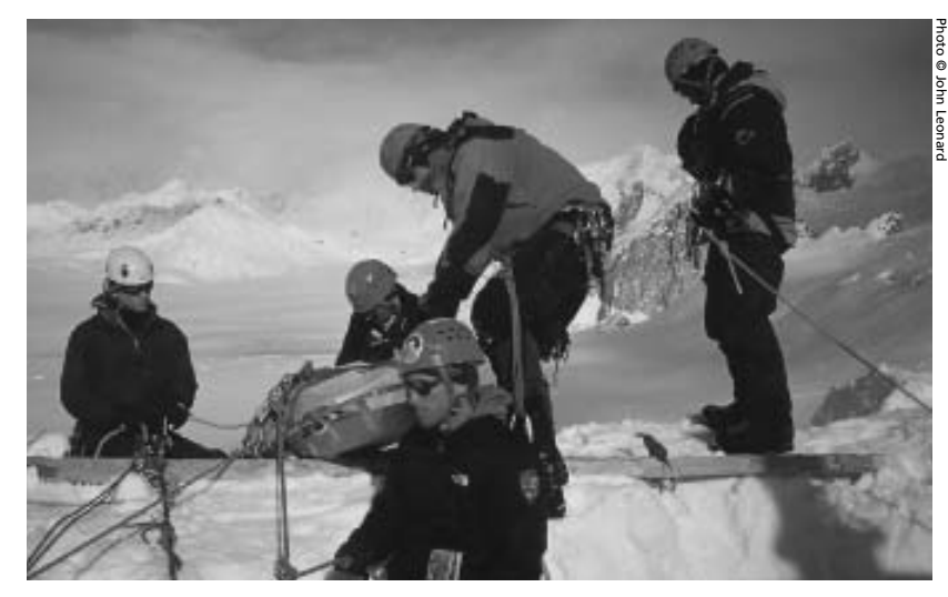
Mountaineering rangers training in the Ruth.

Errors in judgment are educational if they send the right message that turning around at the right time or opting not to go on are decisions that will save your life time and time again. Unfortunately, our virtualreality society presents some problems in defining risk. To some degree, we have come to see it as a quest instead of a warning. The "no fear" philosophy pushes people to navigate in the backcountry regardless of the