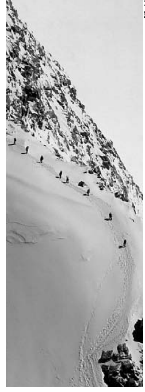
The West Buttress ridge between 16,200' and 17,200'.

In retrospect, most high altitude climbers can recall situations in which their thinking was impaired and their judgment poor. These effects are insidious, since climbers are not aware of the impairment at the time. A controlled exposure in a low pressure chamber is often necessary to convince a climber (or pilot) of the effects of hypoxia. Many high altitude climbing accidents may be attributed to such lack of judgment. Thus, it is important that climbers realize in advance that their mental functions will be impaired. Advance planning should be thorough and complete to avoid a critical situation which poor judgment and slow thinking will magnify. For example, sudden impulsive decisions to go on or return must be considered carefully.