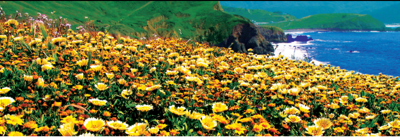
Painting courtesy Arthur Shilstone