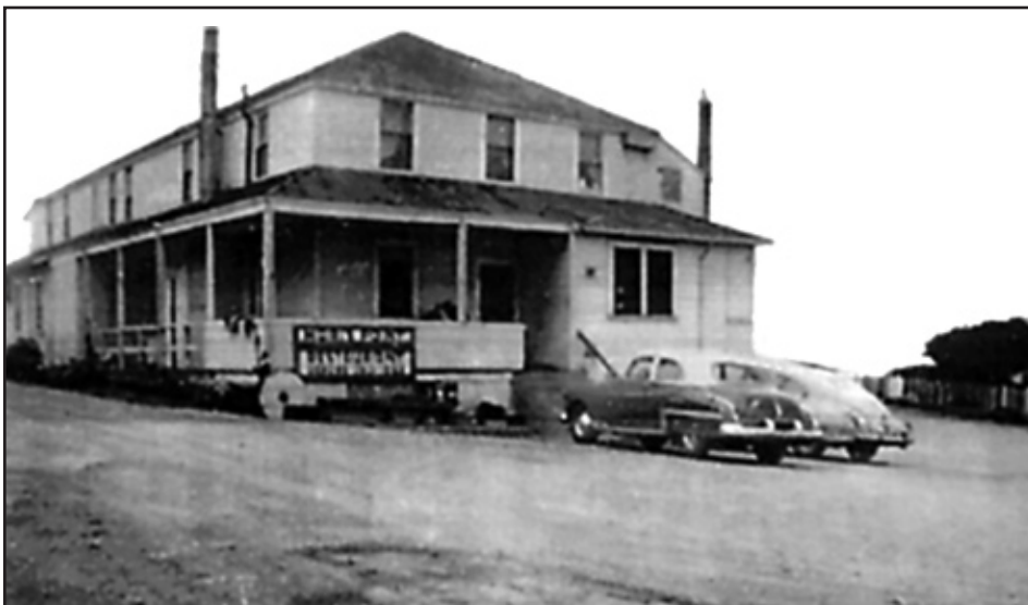
Mori Point Inn, circa 1950s