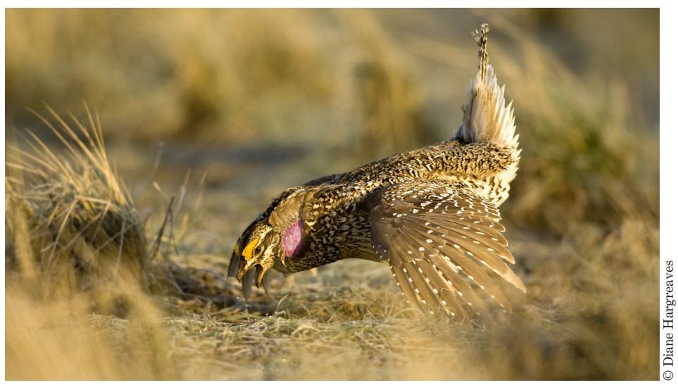
Sharp-tailed grouse in courtship display. The refuge was initially established for the protection of sharp-tailed grouse and pronghorn.

"One of the things I like best about CMR is the distance between the refuge and the nearest Wal-Mart. The remoteness and potential for solitude is outstanding." —Refuge employee at the vision and goals workshop