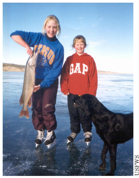
These youngsters show off a northern pike caught on Fort Peck reservoir. Public uses like fishing are often important public issues.

More information about our public involvement process can be found in the Public Involvement Summary , October 2007, which is available on our website.