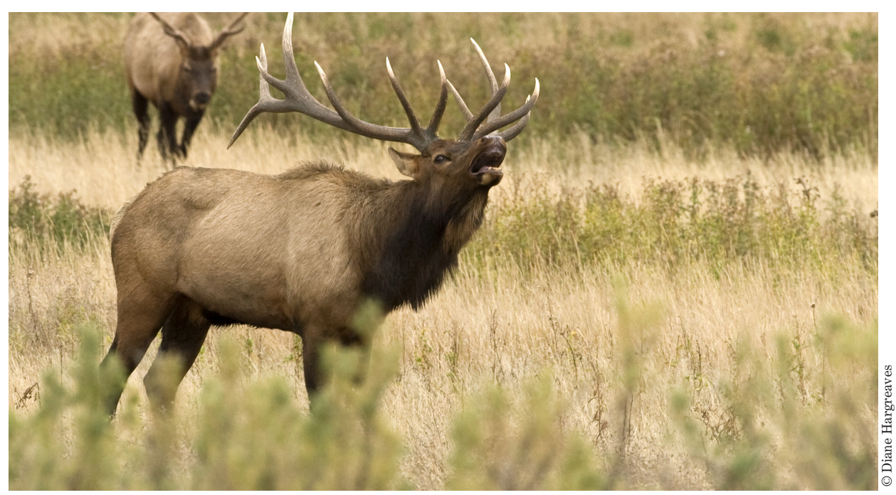
This seven-point bull elk sounds off during the fall rut at Charles M. Russell National Wildlife Refuge. Now is the time for stakeholders to speak out about their ideas for the future of this magnificent refuge.