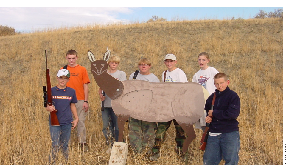
These youths practice their sharpshooter skills. The refuge offers opportunities for young people to get involved in hunting.