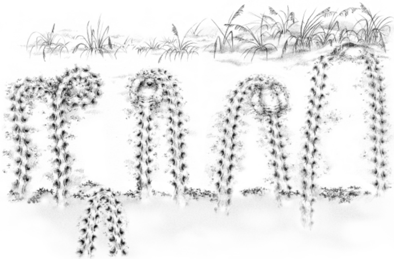
Figure 2. Examples of false crawls (non-nesting emergences) made by loggerheads ( Caretta caretta ) include extensive wandering with no body pitting or digging (A); U-shaped crawl to the high tide line (B); considerable sand disturbance and evidence of body pitting and digging and no evidence of covering (D); and considerable sand disturbance, evidence of body pitting and digging with a smooth-walled egg chamber and no evidence of covering (C). (E) marks the site of a crawl where the relative lengths of the emerging and returning crawls are the same. (F) marks the high tide line.

for example, when the face of the dune collapses on the apex of the crawl (obscuring the crawl sign) or when the apex of the crawl is obscured by dune vegetation and the relative lengths of the emerging and returning crawls are the same (Figure 2 (E)).