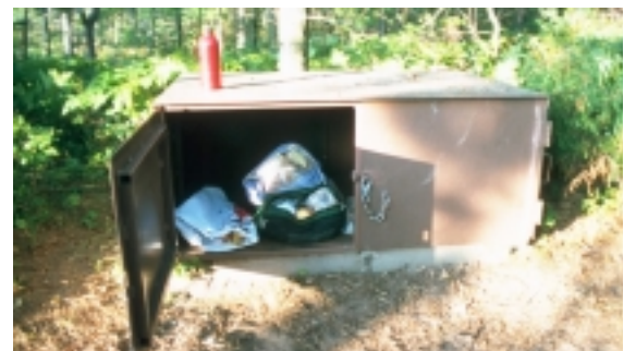
Bearproof food locker