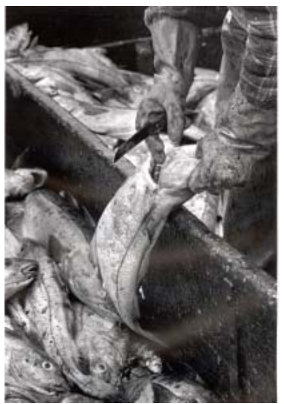
Photograph and caption by Earl Dotter

The fishermen make quick, deft cuts with razor-sharp gutting knives as they dress haddock. On average, each haul-back of the net yielded about 1500 pounds of fish. The catch must be gutted before it is loaded into the fish hold and packed in layers of crushed ice.