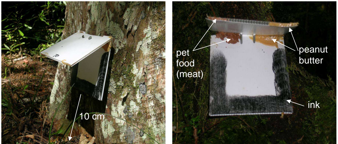
Figure 3. ChewTrack Card design, showing (a) side view, and (b) the location of tracking ink and bait (peanut butter for possums and rodents, meat paste for rodents, stoats and other carnivores).