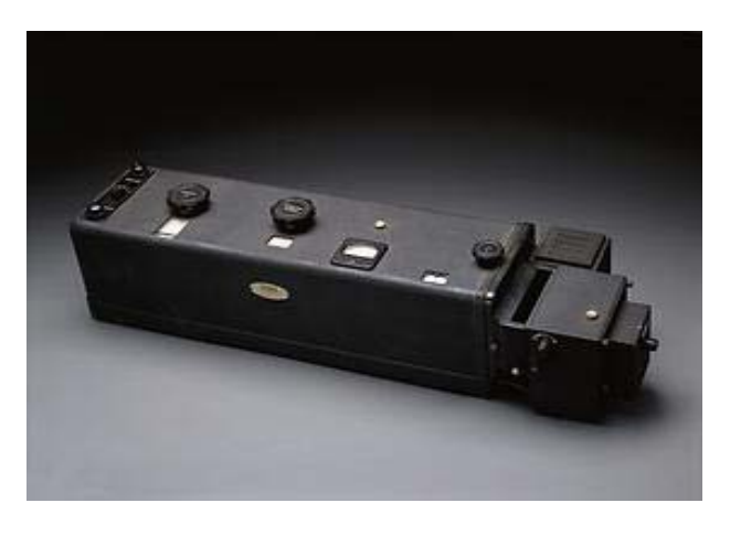
The Stetten Museum's DU Spectrometer

measure vitamins in food, the DU was the first