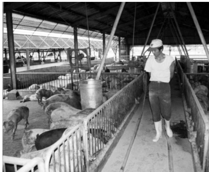
The Council of Agriculture, Executive Yuan, Taiwan, ROC

On March 20, 1997, Taiwan announced an export ban on its pork because of an outbreak of FMD on its hog farms. By the time of the announcement, 3,828 hogs were infected on 28 farms, and 1,440 were dead. The number of farms affected by this highly